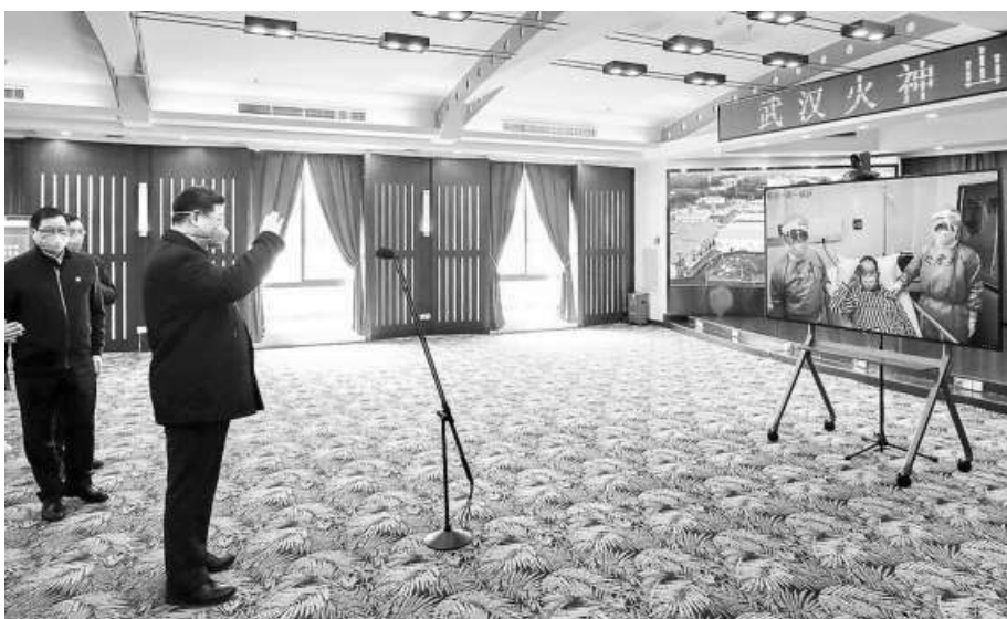
Ground zero: Chinese President Xi Jinping waving at a COVID-19 patient and medical staff via a video link at the Huoshenshan hospital in Wuhan on Tuesday.

Earlier on Tuesday, China said it had just 19 new infections on Monday, down from 40 a day earlier. That also marked the third straight day of no new domestically transmitted cases in mainland China outside of Hubei province, where Wuhan is located, even as the disease spreads rapidly in other countries, including Italy and the United States.