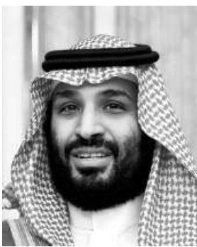
Mohammed bin Salman

"But this is typical MBS, right?" he added, referring to the Crown Prince by his