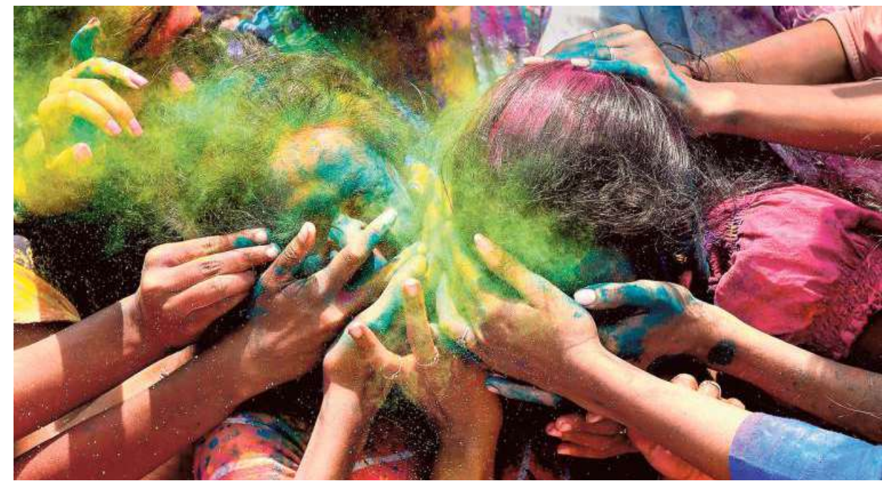
Toned-down colours: Youngsters celebrating Holi on R.K. Beach in Visakhapatnam on Tuesday. Celebrations were a low-key affair across the country as people stayed away from big gatherings amid the COVID-19 scare. K.R. DEEPAK