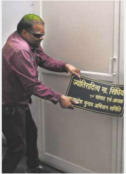
Out of favour: A party worker breaking the name plate of Jyotiraditya Scindia at the State Congress headquarters in Bhopal.

As you well know, this is a path that has been drawing itself out over the last year. JYOTIRADITYA SCINDIA in his resignation letter to congress chief Sonia Gandhi