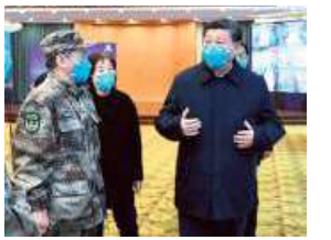
Chinese President Xi Jinping in Wuhan.