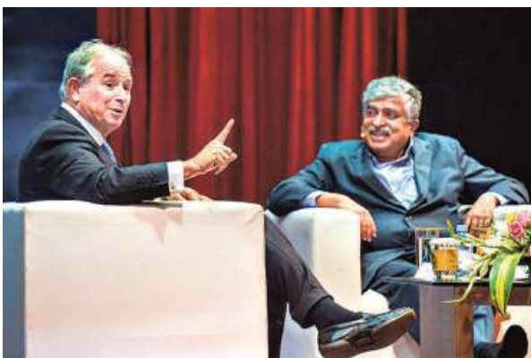
Insightful: Stephen A. Schwarzman (left), chairman and CEO of The Blackstone Group, with Nandan Nilekani, chairman of Infosys, during an interaction at IIT-Bombay.

Mr. Schwarzman said, "I was 17 years old when I found myself on the waiting list at Harvard. I called up