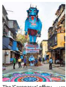
The 'Coronasur' effigy.