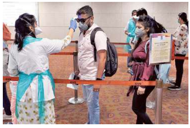
Passengers being screened at Mumbai airport on Tuesday.

Officials of Mumbai International Airport Ltd said 1,27, 819 passengers from the Brijhanamumbai Municipal Corporation along with 10-15 medical and paramedical staff from the Airport Health Organisation (APHO). This will be enough to effectively screen the arrival corridor," an airport official said. From 42 doctors and pa-