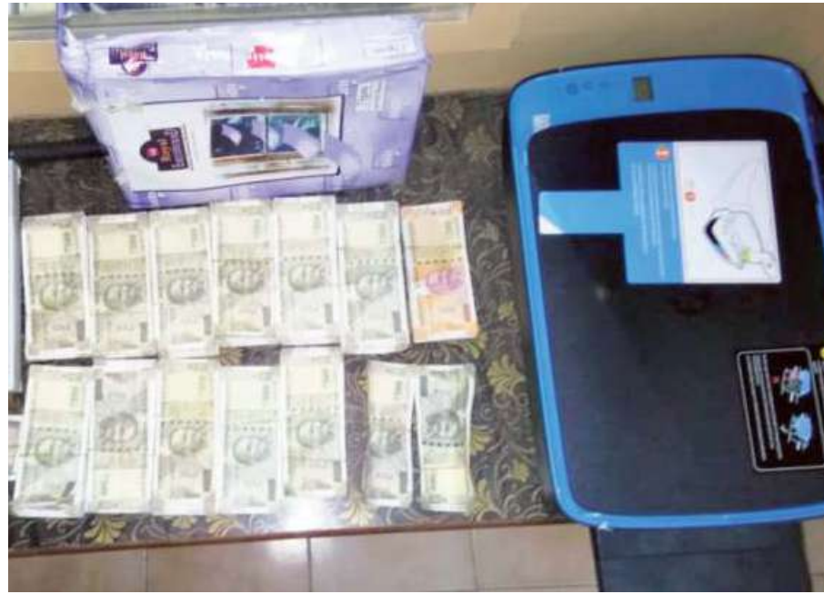
As good as real: The police found genuine currency notes being scanned and then printed on a paper similar to the one used in currency printing at the accused's house.

Notes were printed in Tiruppur, sent to Mumbai for circulation