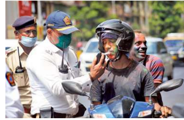
Strict vigil: A biker takes a breathalyser test in Dadar on Tuesday afternoon.

In all, 4,612 people were held for traffic offences in between Monday night and 5 p.m. on Tuesday, police said. "Those who were caught