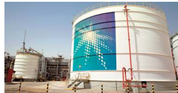
Crude shock: An oil tank at Aramco's Shaybah oilfield in Saudi Arabia, in this file photo.

Oil prices saw their biggest single-day crash in almost 30 years on March 9, throwing global equity markets into turmoil. The price of a barrel of Brent crude closed down 24% at $34.36 after a price war was initiated between Saudi Arabia and Russia, two of the world's largest oil producers. It recovered slightly on March 10, but crashed again. On Thursday, Brent crude price was hovering around $33 a barrel. Prices crashed by almost 50% this year, from $66 a barrel on December 31, 2019 to the current levels, primarily driven by lack of demand.