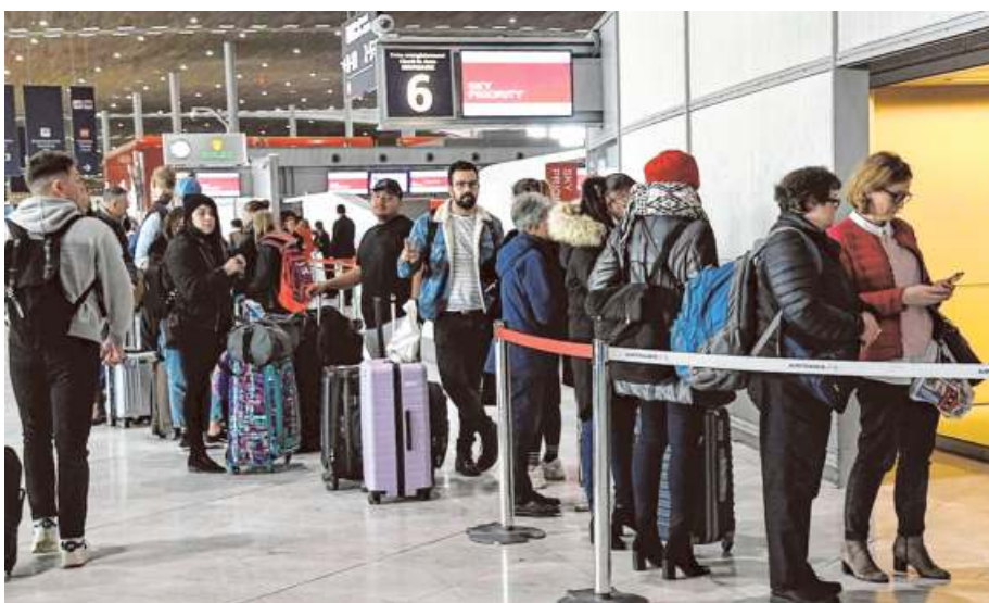
Nowhere to go: Travellers' queue at an information desk at the Paris Charles de Gaulle airport on Thursday after the U.S. announced a 30-day ban on travel from Europe.

And Ken Cuccinelli, acting Deputy Secretary at the Homeland Security Department, went on Twitter to