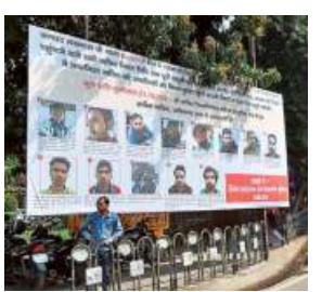
The Allahabad High Court held that the posters were a violation of privacy.