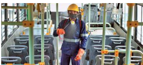
A DTC bus being disinfected in the city on Thursday.

As a related measure, Rashtrapati Bhavan will remain closed for exploratory tour visits from March 13 till further notice. In addition, the Rashtrapati Bhavan Museum Complex and the