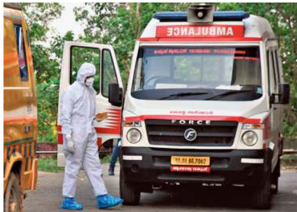
Geared up: An ambulance driver at a screening and isolation facility at the Government Medical College Hospital, Ernakulam, on Wednesday.