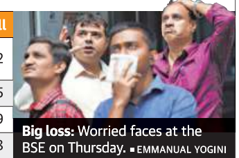
Big loss: Worried faces at the BSE on Thursday.

lowest level since June 2017. The index lost 868.25 points, or 8.30%, to close at 9,590.15.