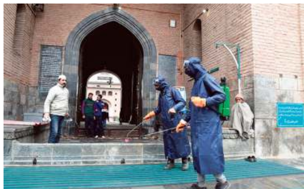
On edge: (From left) Municipality workers in Srinagar carrying out a sanitisation drive at the city's Jamia Masjid on Friday; A roadside vendor selling masks, which are in great demand, in New Delhi; Evacuees at the ITBP facility in the capital after they tested negative for COVID-19; Devotees wearing face masks at the Golden Temple in Amritsar.