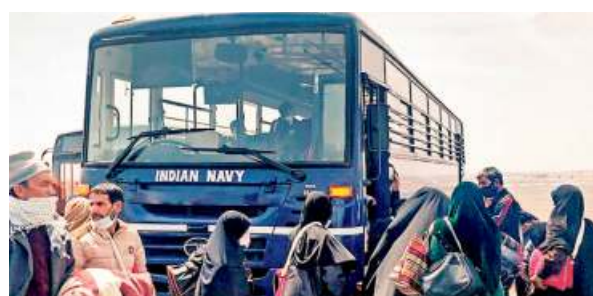
Back home: Indian evacuees brought from Iran at the Chhatrapati Shivaji International Airport in Mumbai. ■ AFP

The first batch comprising 58 nationals were brought back in a C17 military transport aircraft on Tuesday. The Ministry of External Affairs said on Wednesday that the pilgrims and students would be tested before being airlifted, as they