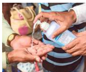
The order was notified under the Essential Commodities Act, 1955. ■ PTI

Centre announces the decision following their shortage in the wake of COVID-19 outbreak