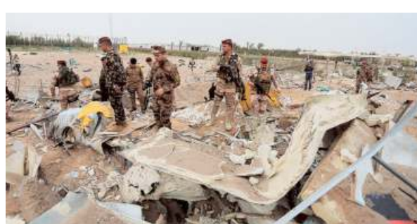
Taking stock: Iraqi soldiers inspecting the destruction at an airport complex under construction in Karbala on Friday.

The U.S. strikes hit bases hosting personnel from the state-sponsored Hashed al-Shaabi military network, U.S. military officials said. The same bases also host Iraqi government forces.