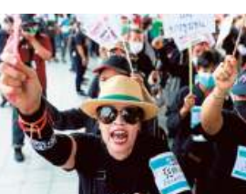
Protesters taking part in a march in Bangkok.

Thailand voted Mr. Prayut's conservative government into power a year ago. It was the first election since