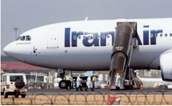
Back home: Indians, who were stuck in the Iranian city of Qom, being brought to Mumbai on Friday.

Delhi-NCR reported yet another positive case of a 46-