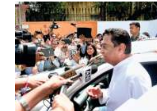
Kamal Nath addressing journalists after meeting Governor Lalji Tandon in Bhopal on Friday.