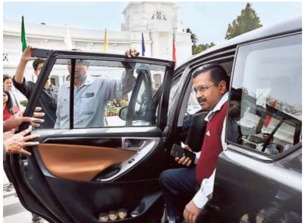
Chief Minister Arvind Kejriwal arrives at the Delhi Assembly in New Delhi on Friday.

By conducting the NPR exercise across the nation, Chief Minister Arvind Kejriwal alleged during his address, the Bharatiya Janata Party-led Central government was attempting to "divert" the attention of people from "the real issues" being faced by the country such as unemployment and economic crises.