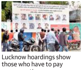
Lucknow hoardings show those who have to pay compensation.