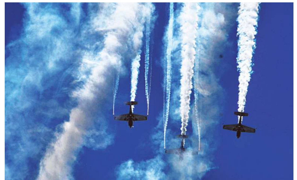
Taking wing: The Mark Jeffery aerobatics team performing during the closing ceremony of the Wings India 2020 aviation show at the Begumpet airport in Hyderabad on Sunday.