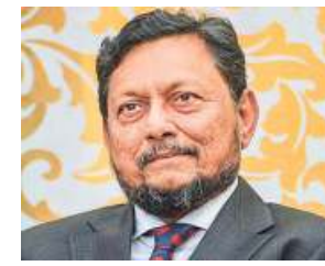
CJI Sharad A. Bobde

by the CJI along with Justices Arun Mishra, U.U. Lalit, D.Y. Chandrachud and L. Nageswara Rao.