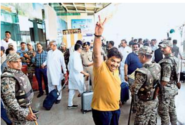
Confident gesture: Congress MLAs arriving in Bhopal from Jaipur, Rajasthan, on Sunday A.M. FARUQUI

It will now have to secure the votes of at least 112 MLAs to prove its simple majority