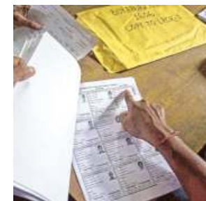
A file photo of villagers checking the final NRC.

The number is a reference to Ms. Begum, who submitted 15 documents, including PAN card, land revenue receipt and bank passbook but did not pass muster for the Gauhati High Court to overrule the order of a Foreigners Tribunal (FT) declaring her a