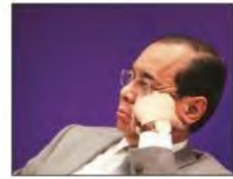
Nominated to Upper House 4 months after retirement

The nomination comes four months after his retirement on November 17, 2019. His tenure as CJJ was marred by allegations of sexual harassment levelled by a Supreme Court woman employee — he was cleared of the charge by an in-house panel before he demitted office.