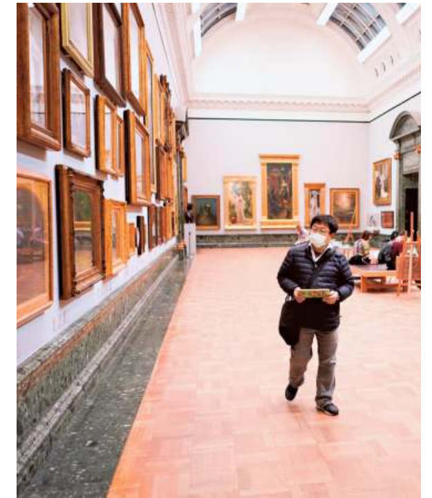
Still life: A visitor inside London's Tate Britain Museum, which announced on Tuesday that it will close till May 1 as a preventive measure against COVID-19.