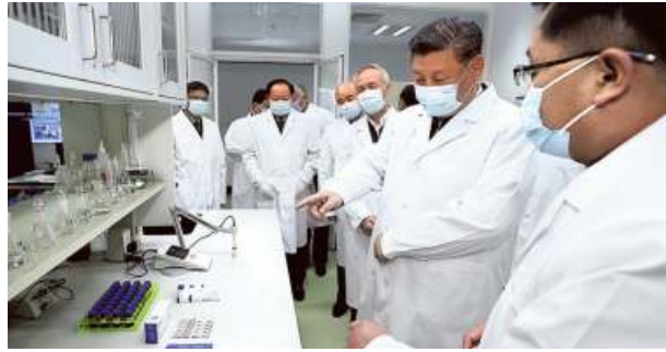
Fighting the virus: Chinese President Xi Jinping, second right, visiting the Academy of Military Medical Sciences in Beijing on March 2.

Researchers will do tests on 108 healthy persons