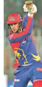
Alex Hales plays for Karachi Kings in the Pakistan Super League.