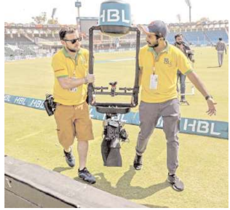
Crew members pack up their equipment at the Gaddafi Cricket Stadium in Lahore as the Pakistan Super League was suspended on Tuesday.

London, March 17: England batsman Alex Hales on Tuesday said he has gone into self-isolation due to fever and persistent dry cough after returning midway from the now-postponed Pakistan Super League (PSL) but is yet to get himself tested for the dreaded COVID-19.