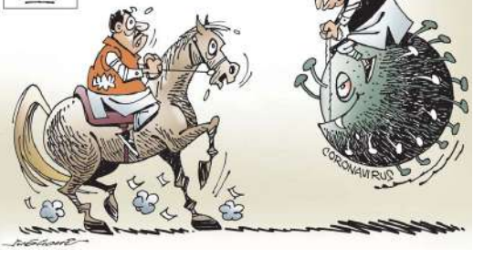
KAMAL NATH AVOIDS FLOOR TEST