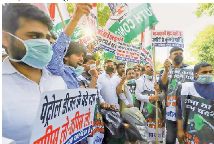
Members of the Indian Youth Congress hold placards during a protest in New Delhi on Tuesday against the price hike in petrol and diesel.