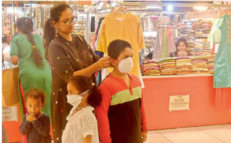
A woman ties masks to her children while shopping in a mall at Kukatpally on Tuesday. Government directed public gatherings, malls, cinema halls to close till March 31 to control the spread of Covid-19.