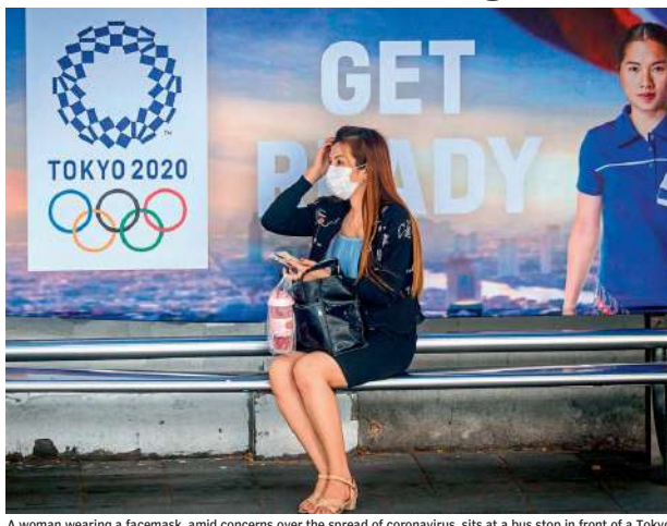
A woman wearing a facemask, amid concerns over the spread of coronavirus, sits at a bus stop in front of a Tokyo 2020 Olympics advertisement in Bangkok, Thailand, on Monday.

"Everyone was still doing hugs, handshakes and 'bises' (cheek kissing)," he said.