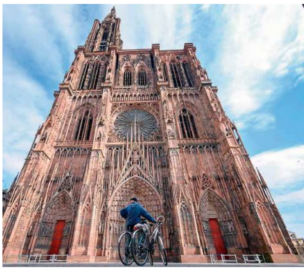
A man stands by bikes on the Cathedral square in Strasbourg, eastern France, on Tuesday as the order of staying at home to all French citizens comes into effect, in order to avoid the spreading of the novel Covid-19.

Thailand calling off its water festival in April. The Dutch banned international travel and is allowing only essential services to stay open. The first confirmed cases of Covid-19 were reported in Somalia. — AP