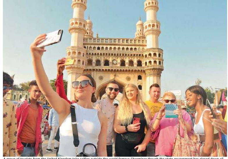
A group of tourists from the United Kingdom take selfies outside the world famous Charminar though the state government has closed down all public places in the wake of the Covid-19 pandemic.

Only five people have tested positive in the state so far, the health minister said.