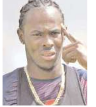
Jofra Archer Archer hits out at racist abuse

London: England pace bowler Jofra Archer said racism should be "addressed properly" after he posted on his Instagram account racist messages he had received. The 24-year-old has been subjected to racist abuse in the past, notably during the second Test defeat by New Zealand last year. A spectator was subsequently banned from international and domestic matches in New Zealand for two years. Archer — who in just seven Test matches since making his debut last year has taken 30 wickets including three five-wicket hauls — said it beggared belief people could post such hateful comments. "I will never understand how people feel so freely to say these things to another human being," he said. "I have given a lot of thought about reacting to this and I hope that no one else has to deal with stuff like this on a regular basis, it is never acceptable and should be addressed properly in my opinion." Archer is presently covering from a stress fracture but is seen as the future pace man for England pace bowling with Stuart Broad. — AFP