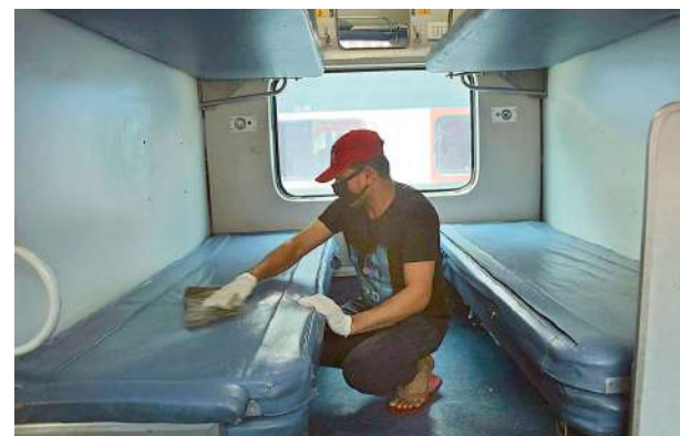
A worker disinfects a train coach as a precaution against Covid-19 in Jammu. For most people, the new coronavirus causes only mild or moderate symptoms. For some it can cause more severe illness. Three railway staffers on board the Delhi-Bhubaneswar Rajdhani Express, who came in contact with a Covid-19 positive passenger, have been asked to quarantine themselves, a senior official of East Coast Railway said on Tuesday.