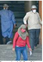
Suspects visit Gandhi Hospital for Covid-19 test on Tuesday.

"We are monitoring every individual who has been in contact with the patients and following strict protocols to prevent the spread of the disease. There is no reason for fear. Every possible suspect is being tested and the health of the rest is being monitored," Health