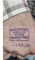
A stamp on coronavirus-affected patient after home quarantine which recognises 14 days of social distancing or earlier if the suspect turns out to be tested negative in Mumbai.