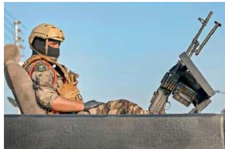
A soldier sits atop a vehicle in Iraq's southern city of Basra on Tuesday.

The Justice Department announced late on Monday it was withdrawing the eight-count indictment of Concord Management and Consulting, just weeks before the trial was due to begin.