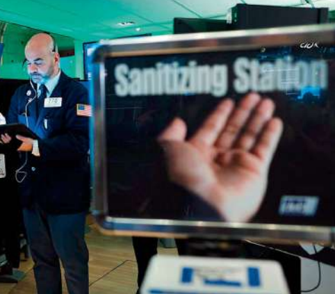
Traders work on the floor of the New York Stock Exchange (NYSE) on Tuesday in New York City.