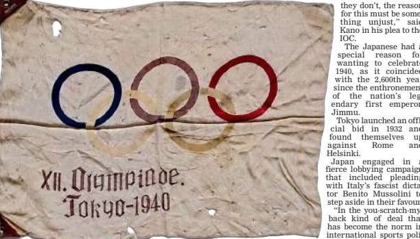
A souvenir flag of the 1940 Tokyo Olympics.

In much the same way, Japan has framed the 2020 Olympics as the "Recovery Games" — a chance to show the country is back on its feet after the catastrophic 2011 triple disaster of earthquake, tsunami and nuclear meltdown.