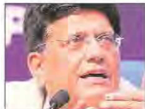
Union Railway Minister Piyush Goyal

Railway Board Chairman V K Yadav was pulled up by the panel for "shoddy presentation" on the preparedness of the national transporter in the wake of Covid-19 outbreak. Officials who attended the meeting, however, said the panel was not as critical