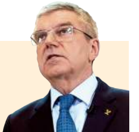
Bach says IOC will keep acting in a responsible way in athletes' interest page 18

PRINTED AT · CHENNAI · COIMBATORE · BENGALURU · HYDERABAD · MADURAI · NOIDA · VISAKHAPATNAM · THIRUVANANTHAPURAM · KOCHI · VIJAYAWADA · MANGALURU · TIRUCHIRAPPALLI · KOLKATA · HUBBALLI · MOHALI · MALAPPURAM · MUMBAI · TIRUPATI · LUCKNOW · CUTTACK · PATNA