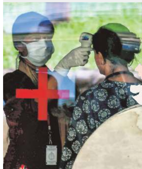
Safety first: Staff at the Sree Chitra Tirunal Institute for Medical Sciences in Thiruvananthapuram screening a visitor for COVID-19.

Tamil Nadu registered its second COVID-19 case on Wednesday evening and Maharashtra's count went up to 44, taking the total number of active cases to 145 in the country