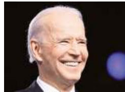
Biden's win in 3 States puts him on track for Democratic nomination page 14