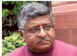
No scheme to shut down BSNL, says Ravi Shankar Prasad page 13