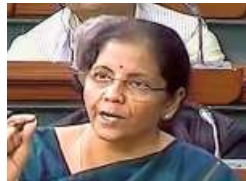
Lok Sabha passes Budgetary proposals for J&K, Ladakh page 12