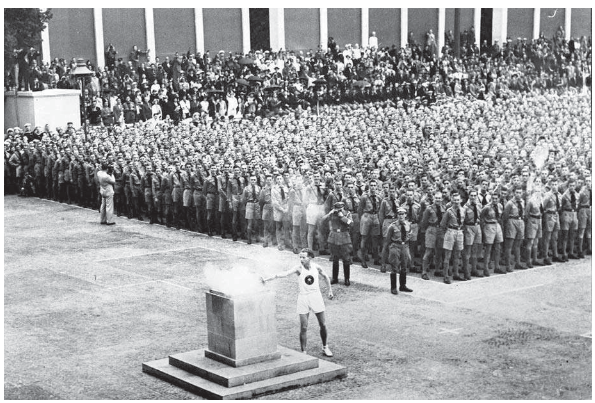
In this file photo, an athlete lights the lamp surrounded by German soldiers before the 1936 Berlin Olympics.