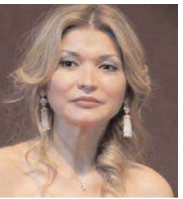
Gulnara Karimova, Uzbekistan ex-leader's daughter jailed

Spanish royal couple in the United States in the future, the statement added. Spain is the fourth hardest-hit nation in the world by the coronavirus pandemic, with over 13,700 confirmed cases as of Wednesday and the number of deaths rising to almost 600. The nation of around 46 million people is on a near total lockdown since the weekend, with people allowed out of their homes only to buy food, medicine or to go to work if they can not do so from home. — AFP