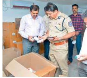
Police seizing products at a duplicate hand sanitiser manufacturing unit in Cherlapally on Wednesday.