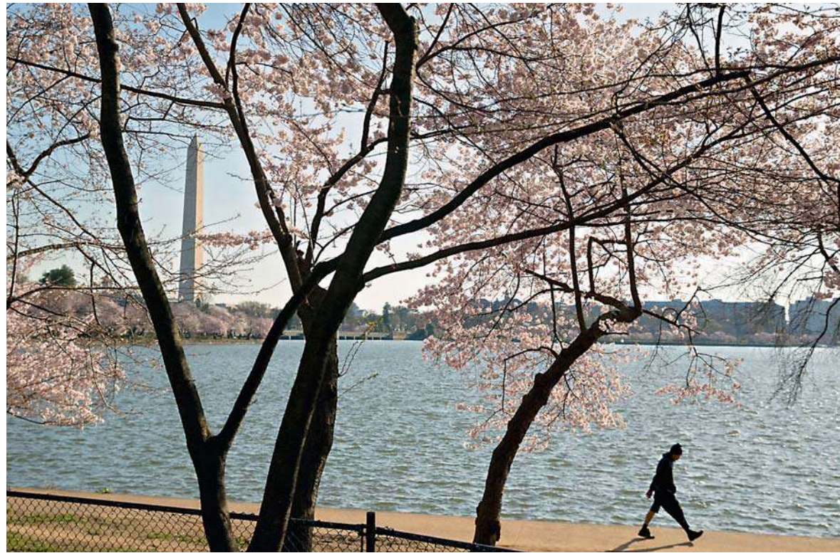
The Washington Monument is visible behind a man walking along an almost empty Tidal Basin lined with cherry blossoms that are about to peak, on Wednesday.