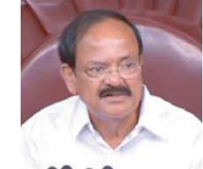
V-P Venkaiah Naidu

Page 2: TS can isolate at least 1,000, says minister