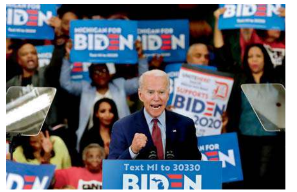
Democratic presidential candidate and former vice president Joe Biden gestures as he speaks during a campaign rally in Detroit.