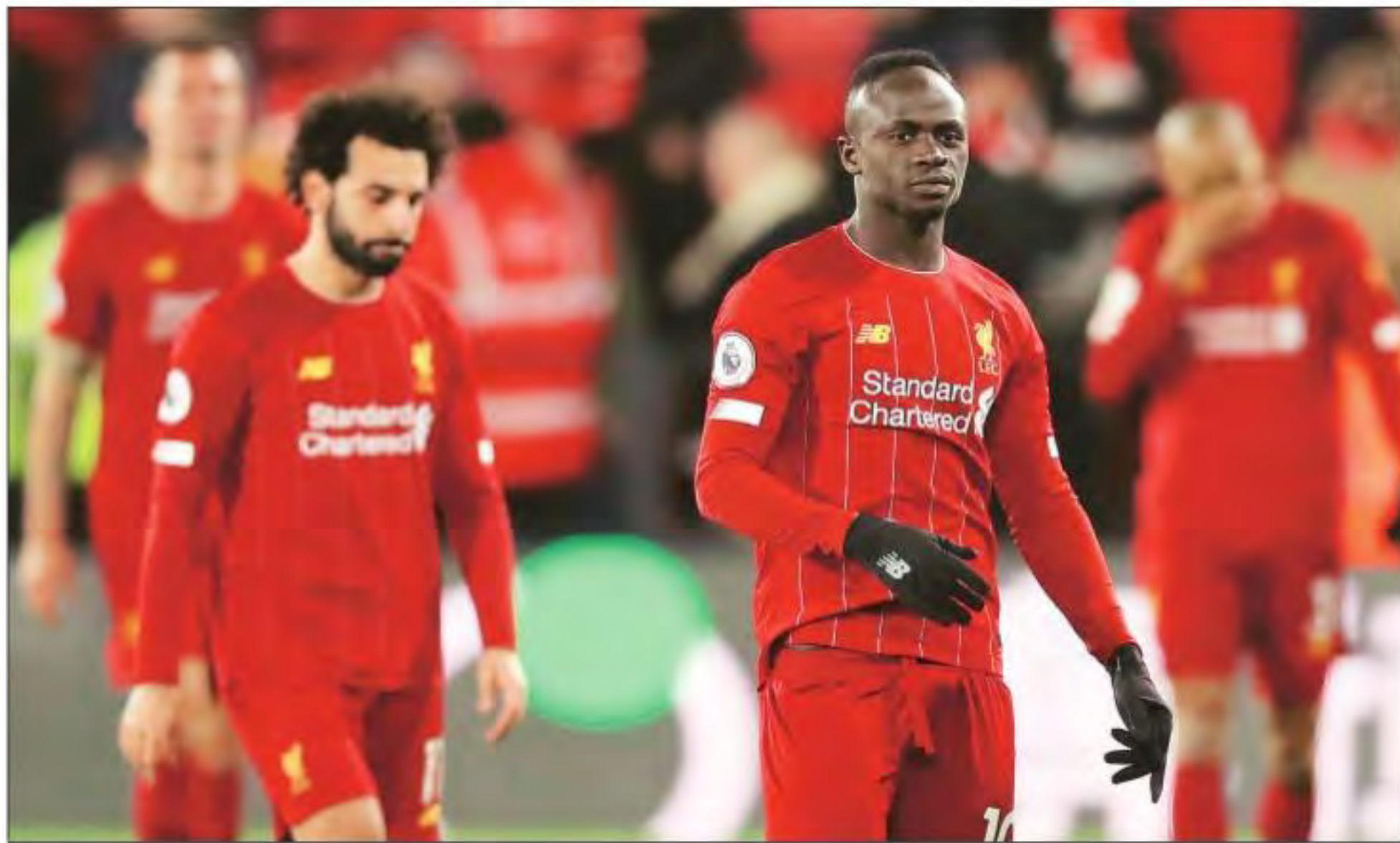
Mo Salah (L) and Sadio Mane look dejected after losing 3-0 to Watford on Saturday, which ended their unbeaten run.

Klopp was keener to praise the quality of his conquerors, who had been inspired by the electric Ismaila Sarr, who scored twice after the break and made the third for Watford captain Troy Deeney. "The most important thing is to congratulate Watford, well deserved. That is what should be the headline. We didn't perform like we should have and Watford performed exactly how they wanted. "That's how football is. It has nothing to do with games you won before, it has nothing to do with the games you will win, it is just this one football game, unfortunately. For tonight, we have to admit Watford were the better team."