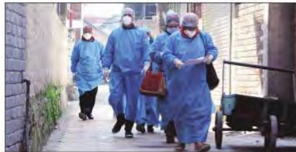
Contact-tracing in Srinagar after Valley's first positive case