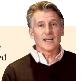
World Athletics chief Sebastian Coe says Tokyo Olympics could be delayed page 18