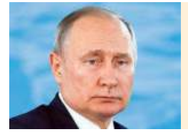
I work every day, listen to what people want. I am not a Tsar, says Putin page 14