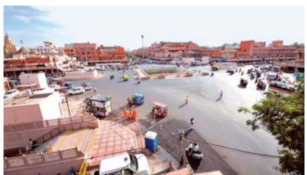
A deserted Badi Chaupar in Jaipur on Thursday after the imposition of prohibitory orders in Rajasthan.