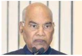
President Kovind on COVID-19 and the message from nature page 10