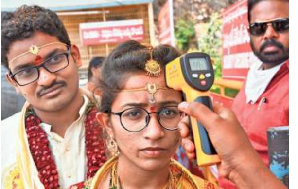
In the shadow of the gun: A newly married couple being scanned at Kanaka Durga temple in Vijayawada.

148 active cases "The total number of active COVID-19 cases across India stands at 148 so far," the Union Health Ministry said. Twenty others have been cured/discharged/migrated. Till Thursday, 14,31,734 people were screened across airports, the Ministry said. Reports from the States put the number of persons in the country who have tested positive at 186, with 167 active cases. Gujarat, Chhattisgarh and Chandigarh reported their