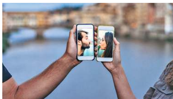
Love is viral: Sites are offering ideas for remote interactions, including an online video game date.