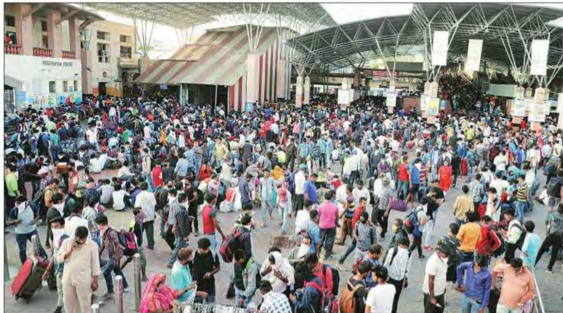
Migrant workers crowd the Pune railway station to board trains leaving the city Friday. Arul Horizon

63 cases in a day; essential services only in Mumbai, Pune; Section 144 in Haryana