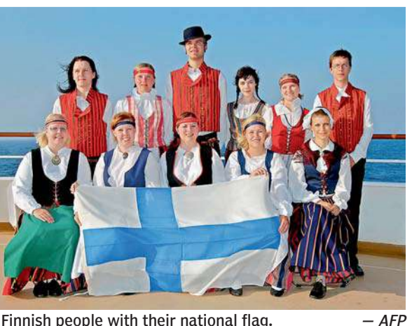
Finnish people with their national flag.

Finland's residents enjoy a high quality of life, security and public services, with rates of inequality and poverty among the lowest of all OECD countries. The data for this year's World Happiness Report was collected in 2018 and 2019, and is there-