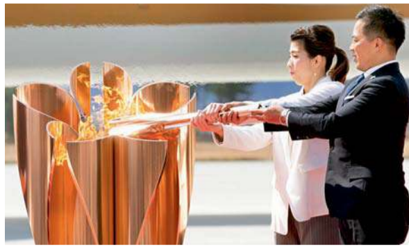
Japanese Olympic gold medallists Saori Yoshida (left) and Tadahiro Nomura light a Tokyo 2020 Olympic cauldron in Higashimatsushima with the Olympic flame, after it was transported from Greece on Friday.

would not be responsible now and it would be premature to start speculation or make a decision at a time when we do not have any recommendation from the task force," he added.