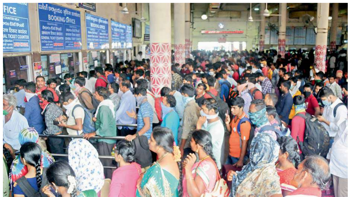
People queue at the Secunderabad railway station on Friday to purchase tickets to travel to their native places in the wake of coronavirus pandemic.

People refrained from crouching at the feet of their mentors. Most of the people did their wuzhu (ablution) at home as requested by the ulema. In some mosques, the management committees provided hand sanitiser to the worshippers and distributed masks. The ulema and imams advised people to offer sunnan and nawafil (optional but spiritually beneficial) rakats at home.