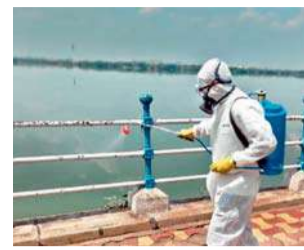
A GHMC worker spraying disinfectant in city.

A special team is collecting information of people living in areas surrounding those where coronavirus-positive patients were identified. The Greater Hyderabad Municipal Corporation's entomology wing has taken up spraying of disinfectants in areas where people are in self-