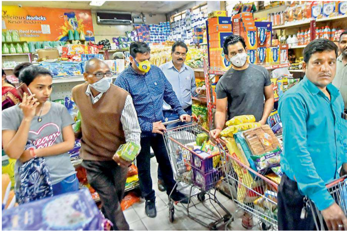
People wearing protective masks shop at Kendriya Bhandar against the backdrop of coronavirus pandemic in New Delhi on Friday.