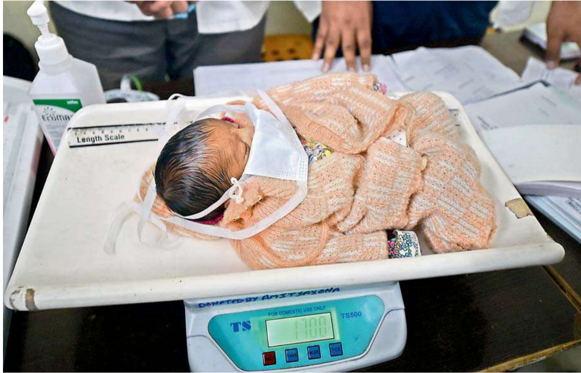
A new-born baby wearing a protective mask in the wake of coronavirus pandemic being weighed at Hailate Hospital in Kanpur on Friday.

Returning from London, the second Covid-19 patient landed at the