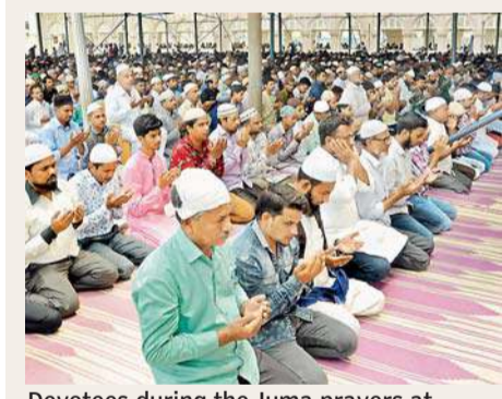
Devotees during the Juma prayers at Macca masjid on Friday. Despite directives issued by religious leaders to avoid large gatherings in view of Covid-19 alert, there was no decline in attendance at mosques.

Similarly, the closure of temples in Puri