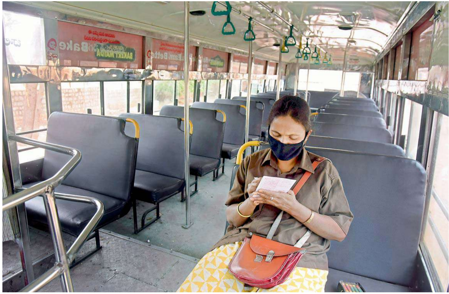
Buses are running without passengers on the city outskirts due to deadly coronavirus scare.