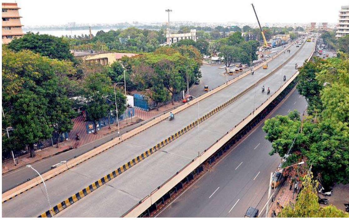
Telugu Talli Flyover sport's a deserted look as people avoid venturing outdoor due to coronavirus scare in Hyderabad on Friday