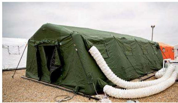
US Army shows large tents established by The 82nd Airborne Division to provide accommodations for up to 600 soldiers at Fort Bragg.

Kabul, March 20: At least two dozen Afghan security forces were killed Friday in an insider attack on their base in southern Afghanistan, officials said, as fighting raged in the war-weary country while efforts to start talks with the Taliban stalled. The pre-dawn attack in Zabul province comes as Afghanistan is grappling with several crises including an increase in Taliban violence that has thrown a supposed peace process into turmoil, mounting coronavirus cases, and a political feud that has seen two men claim the presidency. The attack in Zabul saw several "infiltrators" open fire on their comrades as they slept, according to provincial governor Rahmatullah Yarmal, in one of the deadliest attacks since the US signed a withdrawal deal with the Taliban last month. The pre-dawn raid targeted a joint police and army headquarters near Qalat, the provincial capital. "In the attack, 14 Afghan army forces and 10 policemen were killed," Zabul provincial council chief Ata Jan Haq Bayan said. He added that four other Afghan service members were missing. "The attackers had connections with the Taliban insurgents," Bayan said. They fled in two military Humvee vehicles, along with a pickup truck, weapons and ammunition. Yarmal confirmed the toll.