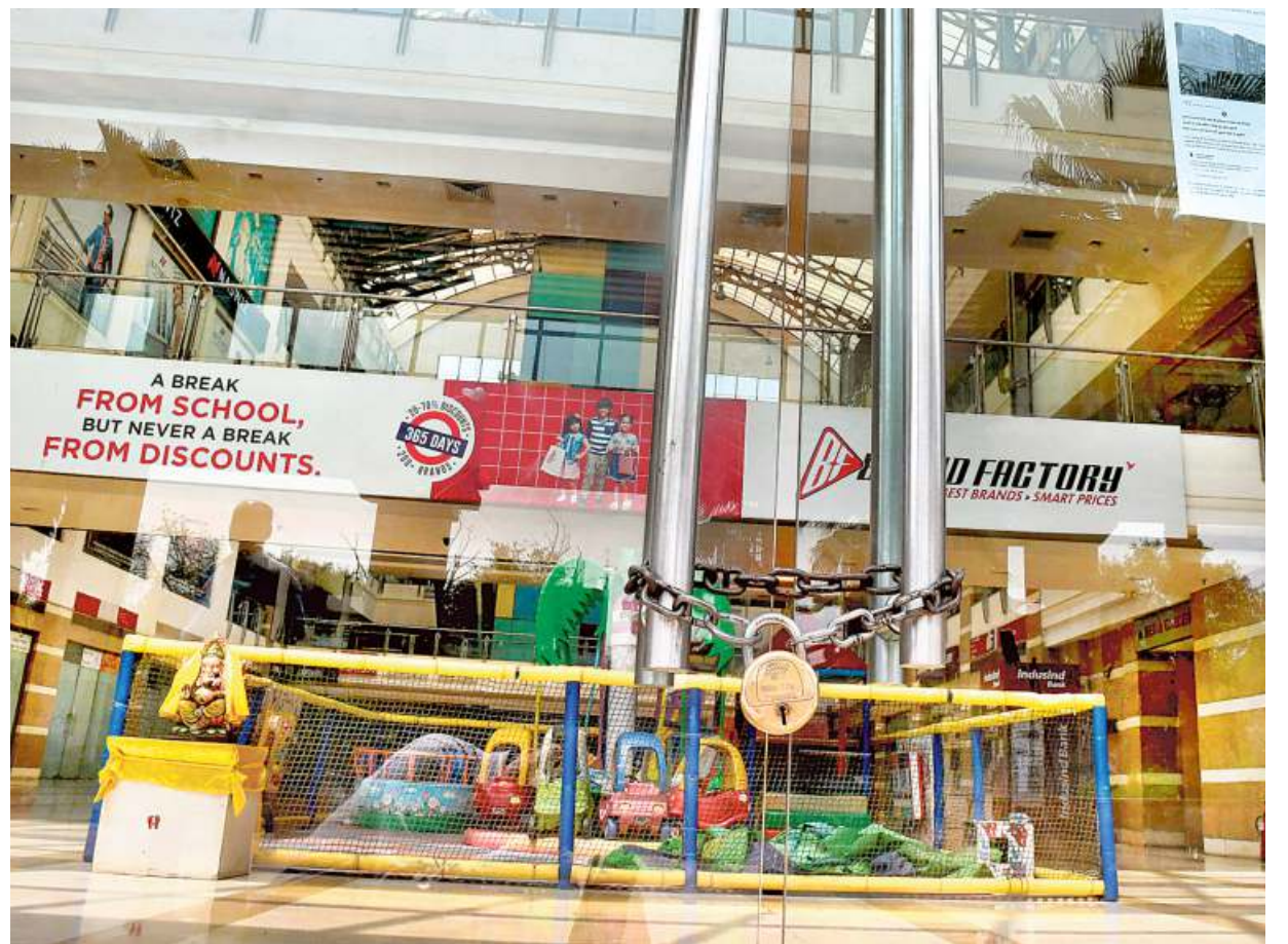
A closed City Square Mall at Rajouri Garden in west Delhi on Saturday amid the ongoing COVID-19 crisis.