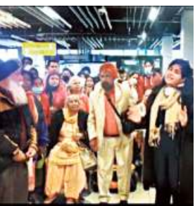
The stranded passengers of the KLM flight.

Among the passengers kept waiting at the Amsterdam airport for three days was a pregnant woman, who developed complications as a result of the tense situation on board, and had to be hospitalised on returning to Amsterdam. Another passenger gave up waiting to return to India and