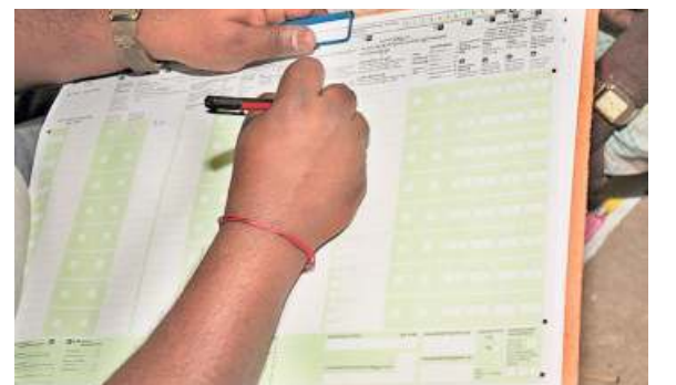
President Ram Nath Kovind was supposed to be the first Indian to be enumerated in the Census and NPR exercise.