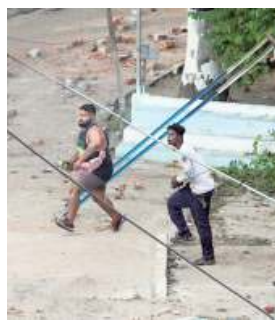
Prisoners indulging in violence.

A senior official of the West Bengal Correctional Services Department said on Friday that allowing fa-