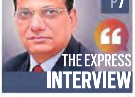
THE EXPRESS INTERVIEW "TOOK NUANCED STEPS... CHANGED WITH SITUATION" V K PAUL NITI AAYOG MEMBER

In an interview to The Indian Express , a day after the country observed Janata Curfew, Paul said, "Today, you can say, as of now we are preparing for Stage 3 and intensification of containment to the best possible extent."