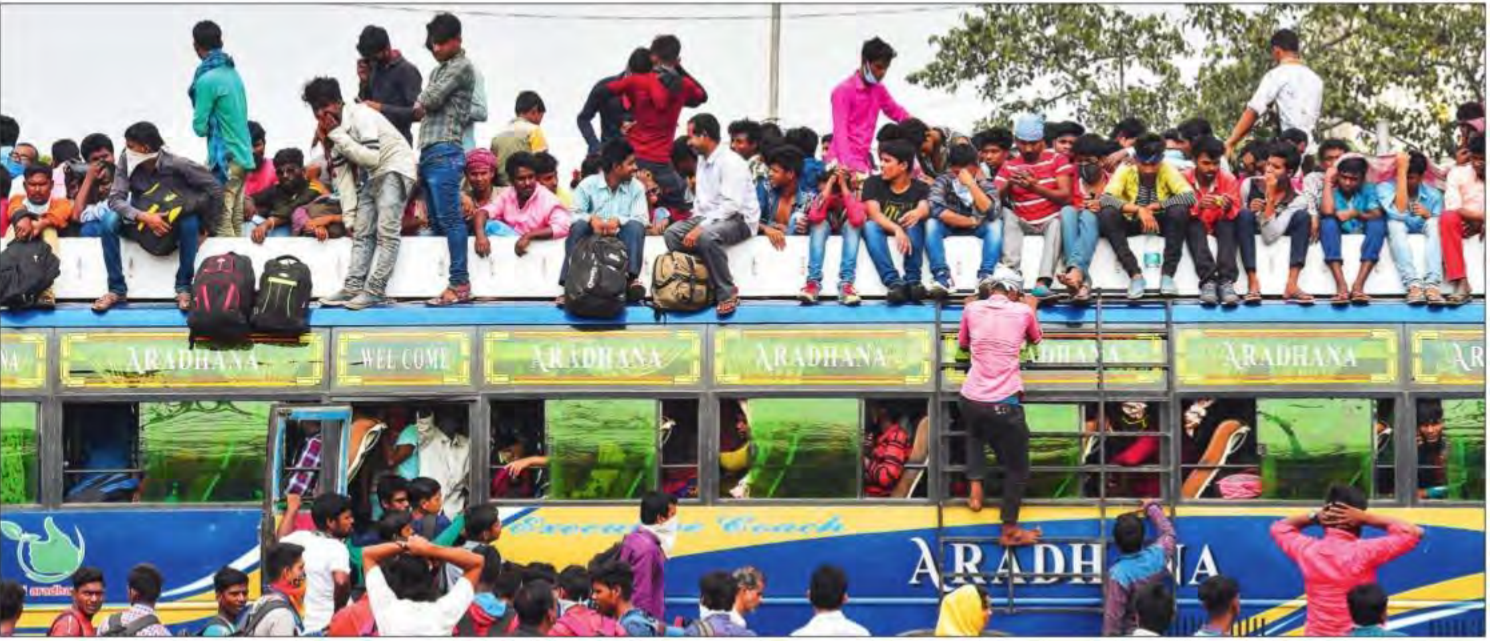
As public transport services start shutting down, people scramble to get onto a long-distance bus in Kolkata on Monday.