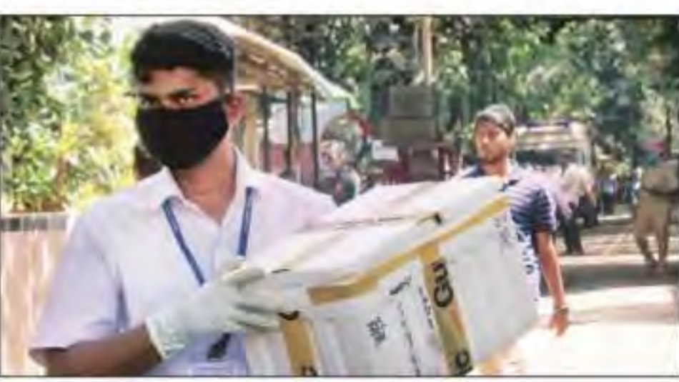
States expect cases to rise, brace for challenge.

While the 120-year-old Victoria Hospital, run by the Karnataka government, has been designated as the first exclusive hospital for COVID-19 patients in the state, in Mumbai, the BMC has tied up with H N Reliance Hospital, owned by Reliance Industries Ltd, to set aside a 100-bed isolation ward in Seven Hills Hospital. The rest