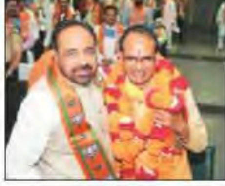
With BJP leader Gopal Bhargava in Bhopal.

The Congress, which won 114 seats in the Assembly polls last December and formed the government with the support of four