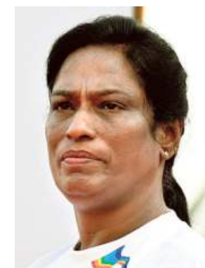
P.T. Usha. •FILE PHOTO

"The Olympics can wait. When you see the happenings around you, especially the situation in Italy, where thousands of lives have been lost, you feel so emotional.