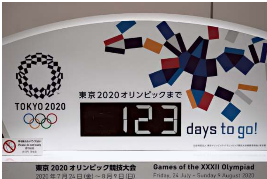
Time running out: With the coronavirus crisis escalating and just four months to go for the start, organisers and IOC are bracing themselves to take a call on deferring the event.

But a groundswell of concern from athletes – already struggling to train as gyms, stadiums and swimming