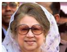
Bangladesh says it will release jailed former PM Khaleda Zia