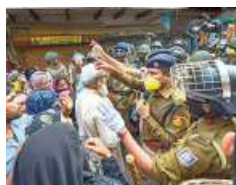
Anti-CAA protesters removed from Shaheen Bagh, other places