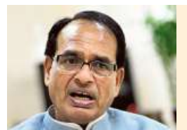
Madhya Pradesh CM Shivraj Singh Chouhan passes floor test