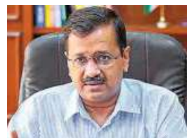
Kejriwal assures regular supply of essential items

NEW DELHI Chief Minister Arvind Kejriwal, in the wake of the 21-day nationwide lockdown announced by Prime Minister Narendra Modi on Tuesday evening, sought to assure citizens that the supply of essential items would not be affected. Earlier in the day, he announced that the Delhi government will give ₹5,000 to each construction worker as their livelihood has been affected due to the COVID-19 outbreak.