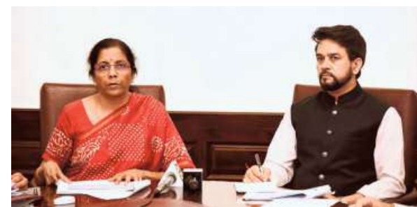
Finance Minister Nirmala Sitharaman along with MoS for Finance Anurag Thakur addressing the media on Tuesday.