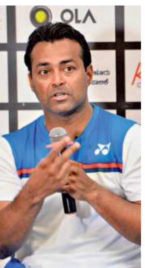
Leander Paes.

In December last year, Paes had announced that 2020 would be his farewell year from tennis and he wanted to sign off after featuring in the Tokyo Games. On his plans following the postponement, he said: "My team and I are evaluating."