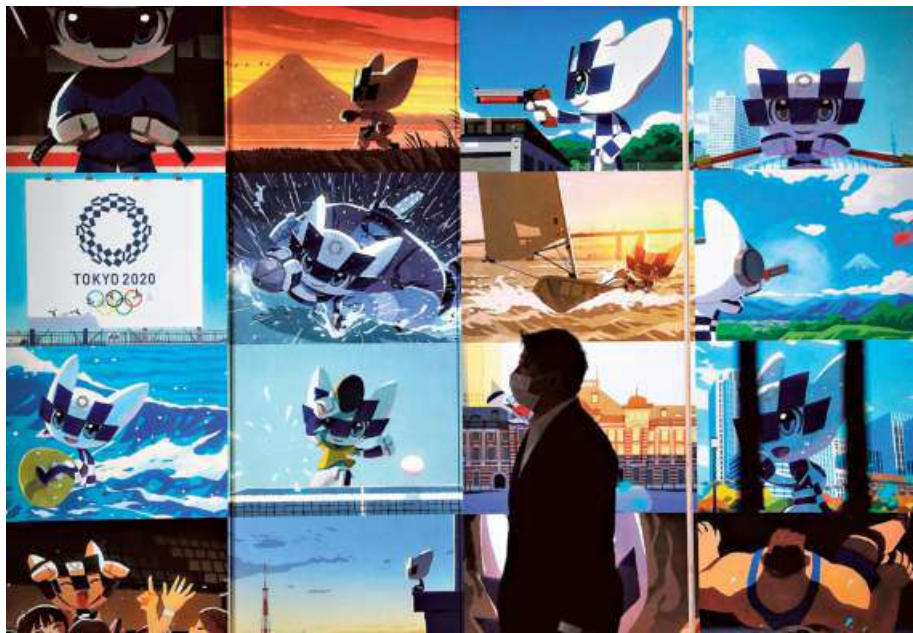
Momentous: A man walks past a billboard promoting the Tokyo Games. The unprecedented, but anticipated, decision to postpone the mega event was taken on Tuesday.

"The leaders agreed that the Olympic Games in Tokyo could stand as a beacon of hope to the world during these troubled times and that the Olympic flame could become the light at the end