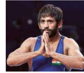
tweet. He also called upon people to make contributions towards the "Haryana corona relief fund."

NEW DELHI Star wrestler Bajrang Punia has donated his six months salary towards fight against the coronavirus pandemic. "I have donated my six months' salary towards relief fund for COVID-19 patients set up by Haryana Chief Minister M.L. Khattar," Punia, who works with the Railways as an officer on special duty (OSD) said in a