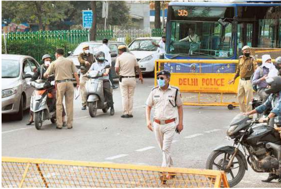
Locked down: Policemen checking IDs of motorists at a barricade put up at INA as restrictions are in place in the Capital till April 15; a man buying vegetables from a vendor; air passengers walking from the IGI Airport.