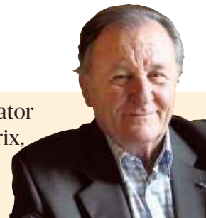
Albert Uderzo, a creator of French hero Asterix, dies at 92 page 15

PRINTED AT • CHENNAI • COIMBATORE • BENGALURU • HYDERABAD • MADURAI • NOIDA • VISAKHAPATNAM • THIRUVANANTHAPURAM • KOCHI • VIJAYAWADA • MANGALURU • TIRUCHIRAPPALLI • KOLKATA • HUBBALLI • MOHALI • MALAPPURAM • MUMBAI • TIRUPATI • LUCKNOW • CUTTACK • PATNA