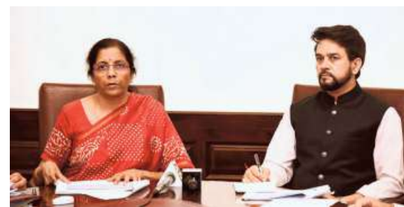
Finance Minister Nirmala Sitharaman along with MoS for Finance Anurag Thakur addressing the media on Tuesday.