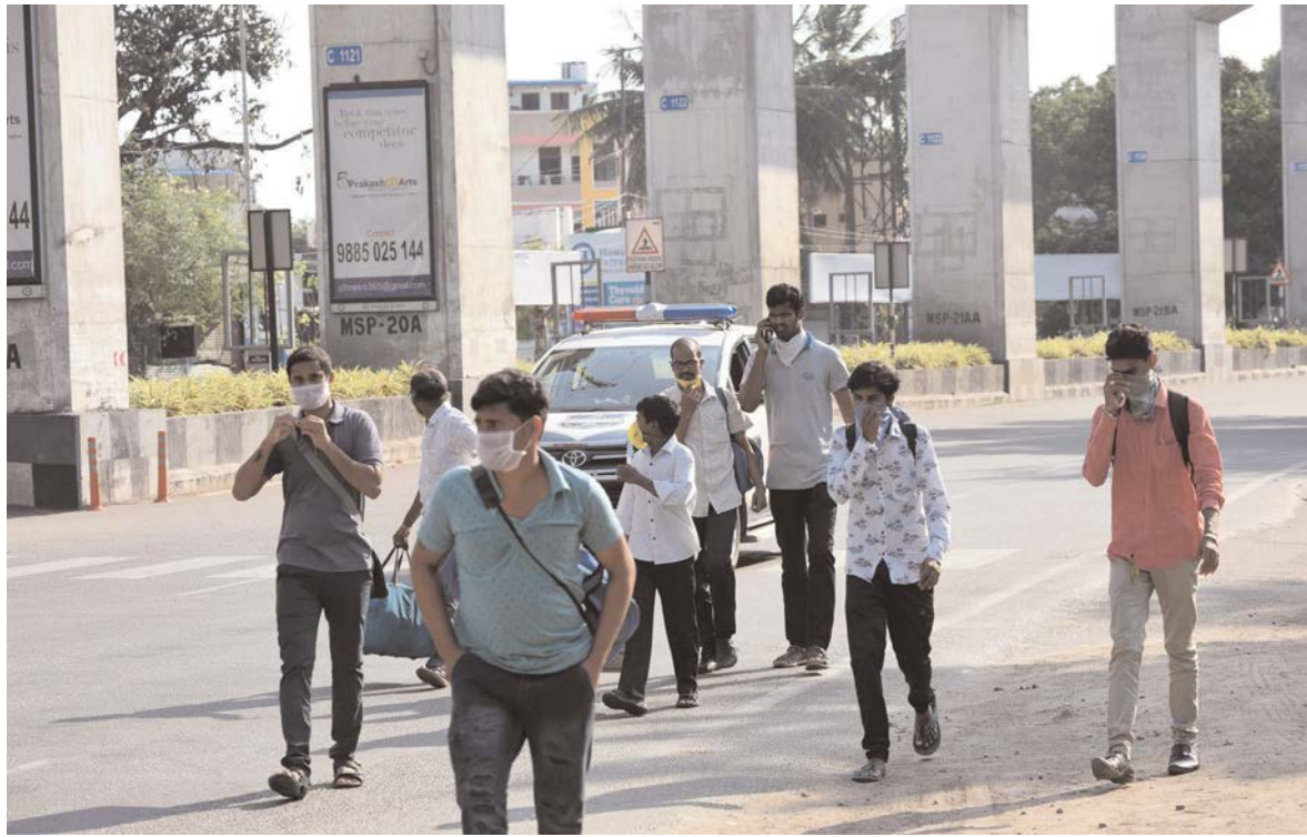
People leave their hostels in Secunderabad on Wednesday and walk towards LB nagar hoping to find some means of transport to help them reach their villages.