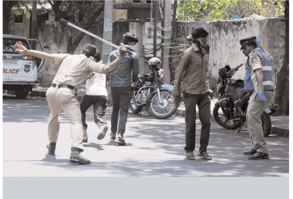
Police use lathis on those who were found roaming the streets during lockdown on Wednesday.