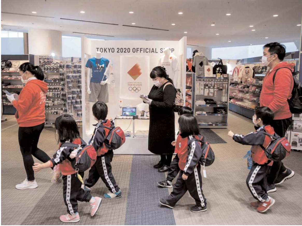
Children walk past a Tokyo 2020 official shop in Tokyo on Wednesday, a day after the historic decision to postpone the 2020 Tokyo Olympic Games.