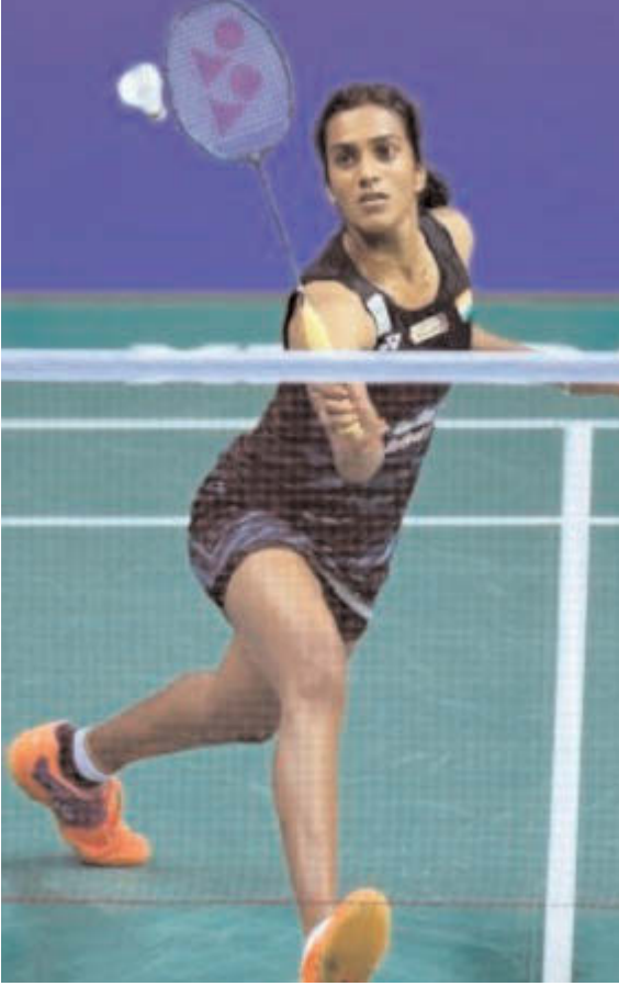
P. V. Sindhu in action in this file photo.

Shuttlers in the singles competition have to be inside top-16 of world rankings to qualify for the Olympics. In doubles, a country can field one pair if they are in the top 16 and two if both pairs are in the top eight. The BWF welcomed the International Olympic Committee (IOC)'s decision to postpone the Olympics, originally scheduled from July 24 to August 9, to next year in the wake of the pandemic, which has caused nearly