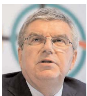
These postponed Olympic Games will need sacrifices, will need compromises from all stakeholders. It was very clear from the beginning that cancellation was not something the IOC would in any way favour. — THOMAS BACH, president of International Olympic Committee

Japan has framed Tokyo 2020 as the "Recovery Games" — a chance to show the world it has bounced back from the "triple disaster" in 2011 when a massive earthquake sparked a tsunami and the Fukushima nuclear meltdown. — AFP