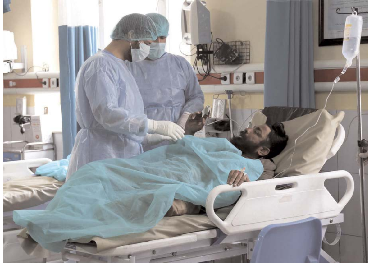
An man is treated in a hospital after a gunman stormed a religious gathering of Afghanistan's minority Sikhs at a gurdwara in Kabul on Wednesday.