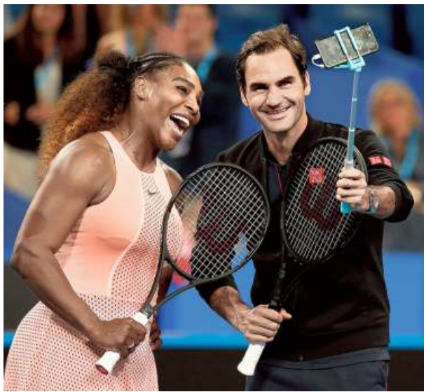
One more time: Serena and Federer would love to hear their national anthems again.

"Overall, it was probably the most unbelievable Olympics I ever had," said Federer, who was also Switzerland's flag-bearer in Beijing and in Athens in 2004 where he