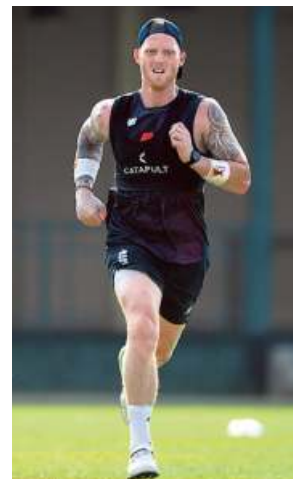
Ben Stokes.