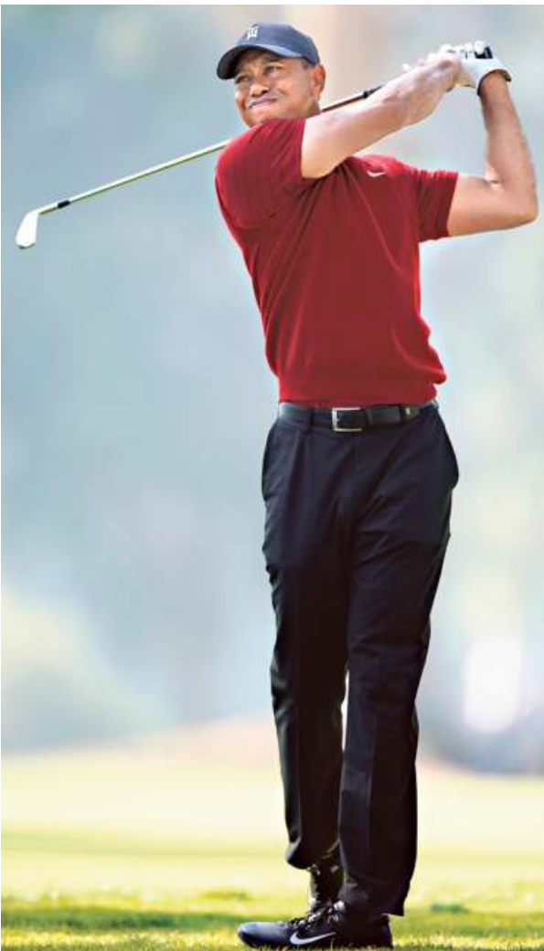
The ultimate prize: Tiger Woods, winner of 15 Majors, will be gunning for an Olympic medal.

Felix, who turns 35 at the end of this year, will be racing against Father Time as she attempts to improve her tally in what will be her fifth consecutive Olympics appearance. The American star can take comfort from the fact she is by no means the oldest woman to chase Olympic glory in sprint events. Merlene Ottey was 40 when she anchored Ja-