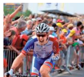
France evokes Tour de France spectator ban PARIS French sports minister Roxana Maracineanu says this year's