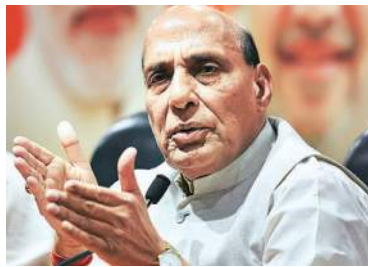
Defence Minister Rajnath Singh is heading the committee