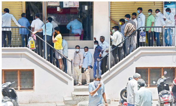
A large number of customers line up, without maintaining social distance, to purchase medicines at a wholesale medical shop in Secunderabad on Saturday. — S.SURENDER REDDY