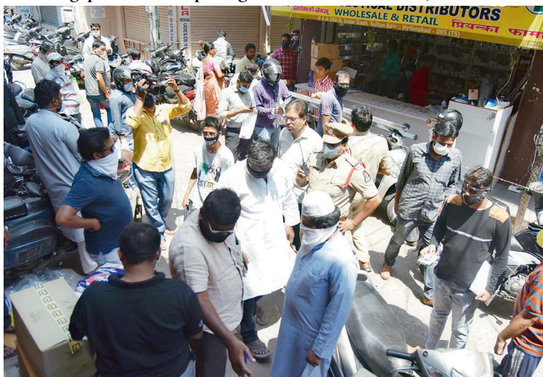
People who came to buy medicines at the wholesale medical shops go about their business without maintaining any social distance near Koti, Hyderabad, on Saturday.

Social media networks are buzzing with misinformation on the Covid-19 epidemic. Although many social media outlets came out with reports and tried to give out authentic data, still the social media is flooded with fake audio clips which are creating panic among citizens.