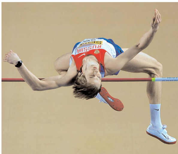
Russia's high jumper Andrei Silnov, who is charged with doping based on evidence from the bombshell McLaren report, in action in this file photo.

Denver, March 28: The postponement of the Tokyo Games has catapulted the sports organizations that make up the backbone of the U.S. Olympic team into crisis. At least one has already started layoffs and others are desperate to stay solvent.