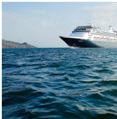
The Zaandam cruise ship is anchored in the bay of Panama City. Several passengers have died aboard the cruise ship and two people aboard the ship have tested positive for the new Covid-19, the cruise line said, with hundreds of passengers unsure how long they will remain at sea.

The authority said the bodies of the virus victims would remain on the Zaandam until the liner arrives at its final destination. The Panama Maritime Authority said it regrets these deaths, as well as the complex situation of the passengers and crew of the Zaandam cruiser go through," the statement said.