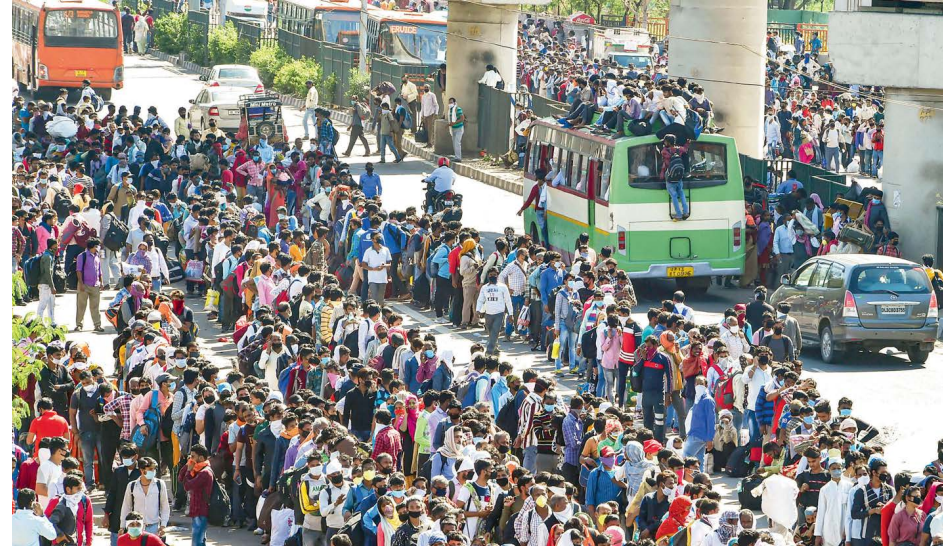
Migrants wait to board a bus to their native villages during the nationwide lockdown imposed in the wake of coronavirus pandemic at Kaushambi in Ghaziabad on Saturday.