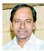
K. Chandrashekar Rao purchasing their share of chicken and eggs.

Following the CM's advice, price of chicken has shot up from ₹50 per kg to ₹177 per kg at retail outlets of the city. People queued up in large numbers at the outlets for