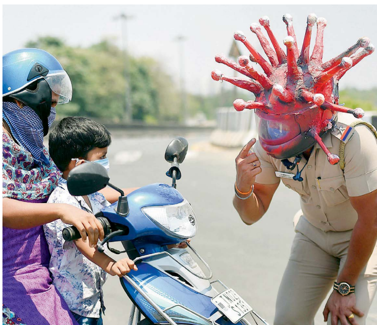
A police officer wearing a helmet depicting coronavirus requests commuters to stay at home during a nationwide lockdown to limit the spread of the virus in Chennai.

In India, like the rest of the world, the spread of coronavirus has become alarming and is posing severe health risks.