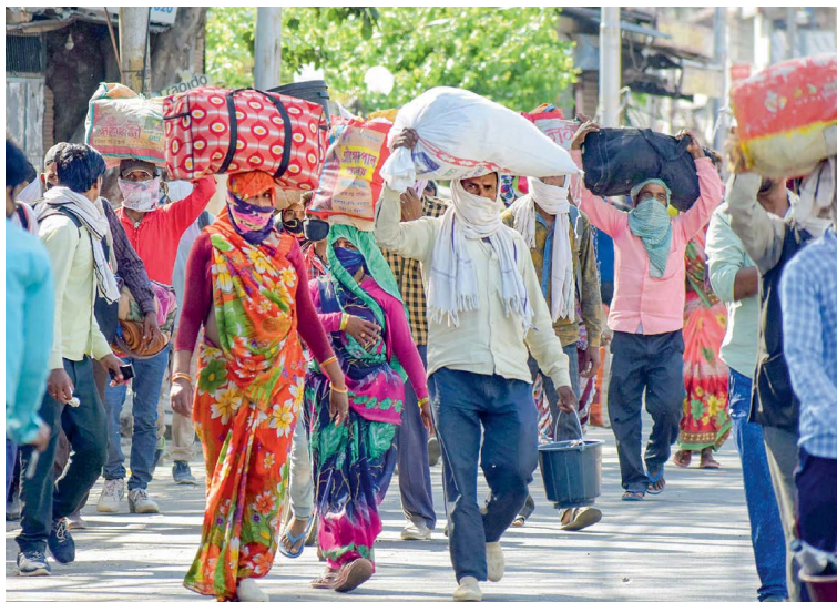
Migrants walk towards their native places during nationwide lockdown imposed in the wake of coronavirus pandemic in Prayagraj on Saturday.

A day after talks with the top three figures at the centre, Banerjee was not going out in public places on Saturday. During one of her visits, Banerjee was reportedly heard asking shop owners to keep their shutters open. The state government had previously resumed bus services on six routes in Kolkata for workers in emergency services.