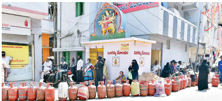
Consumers form a long queue of empty LPG cylinders to get them refilled at an agency in Dabeerpura in Old City on Saturday.