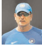
(This rest) cannot be a bad thing because towards the end of the New Zealand tour, you could see some cracks coming up when it came to mental fatigue, physical fitness and injuries.

As with other sports across the world, cricket has also been affected with all international and domestic fixtures being called off due to the outbreak of the novel coronavirus. "This rest cannot be a bad thing because towards the end of the New Zealand tour, you could see some cracks coming up when it came to mental fatigue, physical fitness and injuries," Shastri said.