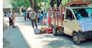
Residents form a queue to purchase essential items from a mobile rythu bazaar van on Saturday.

The Mayor stressed that people can immediately complain to the local police and warders, who are selling essential commodities at exorbitant prices during the lockdown period. He appealed to the citizens not to fall prey to black-marketers and hoarders, who are selling essential commodities at exorbitant prices during the lockdown period.