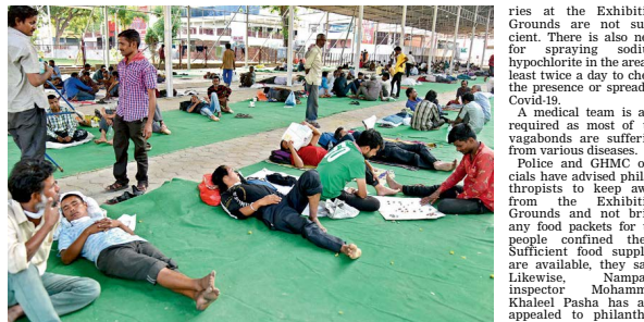
A large number of people have been rehabilitated at the Exhibition Grounds in Nampally, in view of the lockdown, on Saturday. — S. SURENDER REDDY

The Greater Hyderabad Municipal Corporation and Hyderabad City Police have shifted more than a thousand vagabonds to Exhibition Grounds in Nampally to ensure that they maintain social distance following the spread of Covid-19.