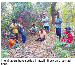
The villagers have settled in Bapli hillock on Charmadi ghat.

These people entered the forest a couple of days back and their departure came to light on Saturday. Meanwhile, as many as 10 new positive cases of coronavirus have been confirmed in Karnataka, taking the total number of the affected in the state to 74, the Health department said on Saturday. "Till date 74 Covid-19 positive cases have been confirmed which includes 10 new positive cases," the department said in the mid-day situation update.