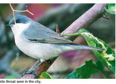
A Hume's white throat seen in the city.

For example, we could see parrots at a few places in the city but now, their numbers too have gone up and they are there everywhere."