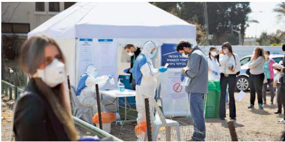
Safe voting: People quarantined for coronavirus arriving to cast their votes in a specially made tent in Tel Aviv, Israel, on Monday.

“In the last 24 hours there were almost nine times more COVID-19 cases reported outside China than inside China,” WHO chief Tedros Adhanom Ghebreyesus told