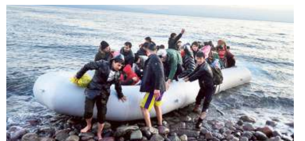
Humanitarian crisis: Migrants arriving at Skala Sikaminias, on the Greek island of Lesbos, after crossing the Aegean sea.

He warned Europe that it will have to shoulder its part of the refugee crisis triggered by violence in the region. “After we opened the doors, there were multiple calls saying ‘close the doors’. I told them ‘it's done. It's finished. The doors are now open. Now, you will have to take your share of the burden,’” he said.