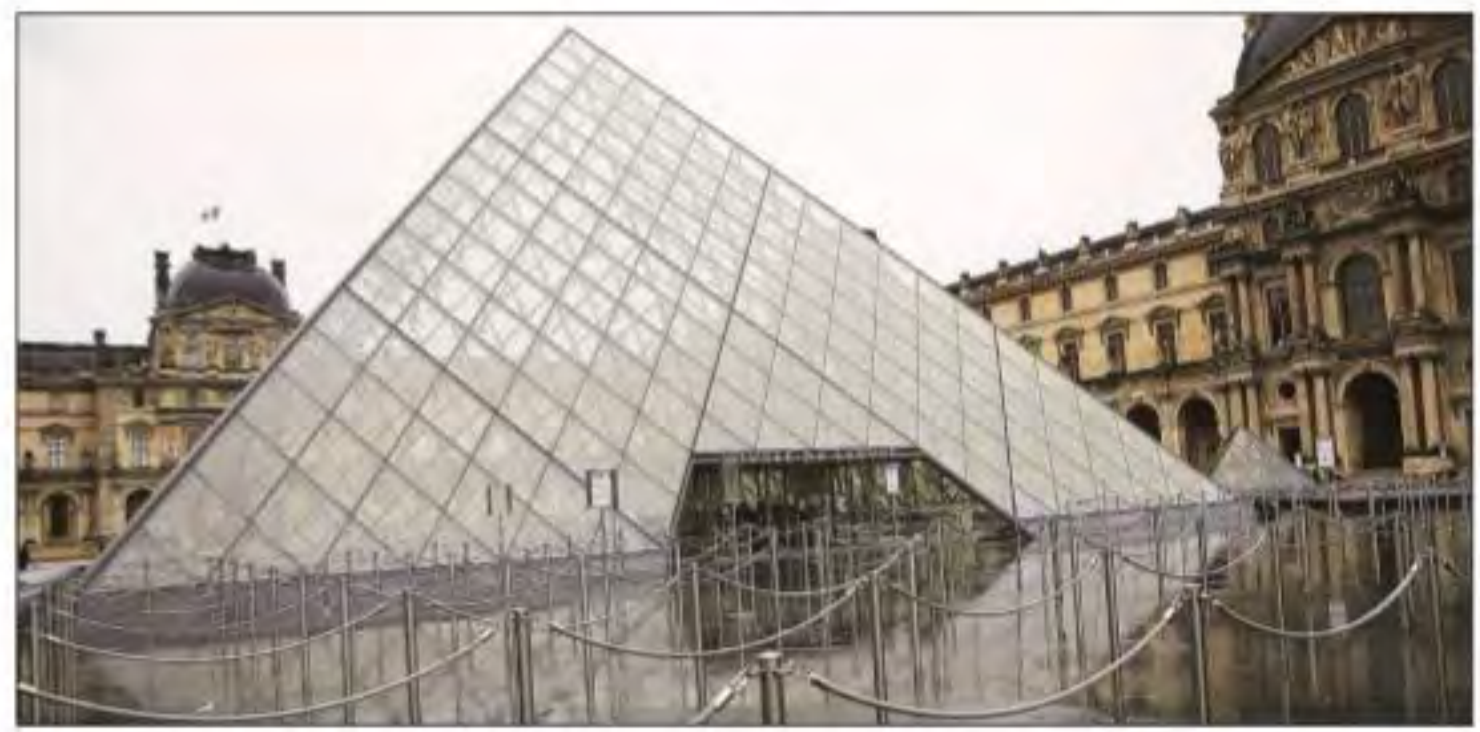
The line outside the Louvre museum in Paris is empty on Monday after it was closed as the coronavirus spreads in Europe.

SOUTH KOREA sought murder charges against leaders of a secretive church at the heart of its ballooning coronavirus outbreak on Monday as the global death toll rose above 3,000.