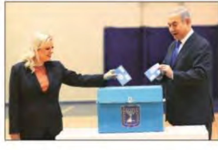
Israeli Prime Minister Benjamin Netanyahu and his wife Sara cast their votes.

ISRAELIS VOTED Monday in an unprecedented third election in less than a year to decide whether longtime Prime Minister Benjamin Netanyahu stays in power despite his upcoming trial on corruption charges.