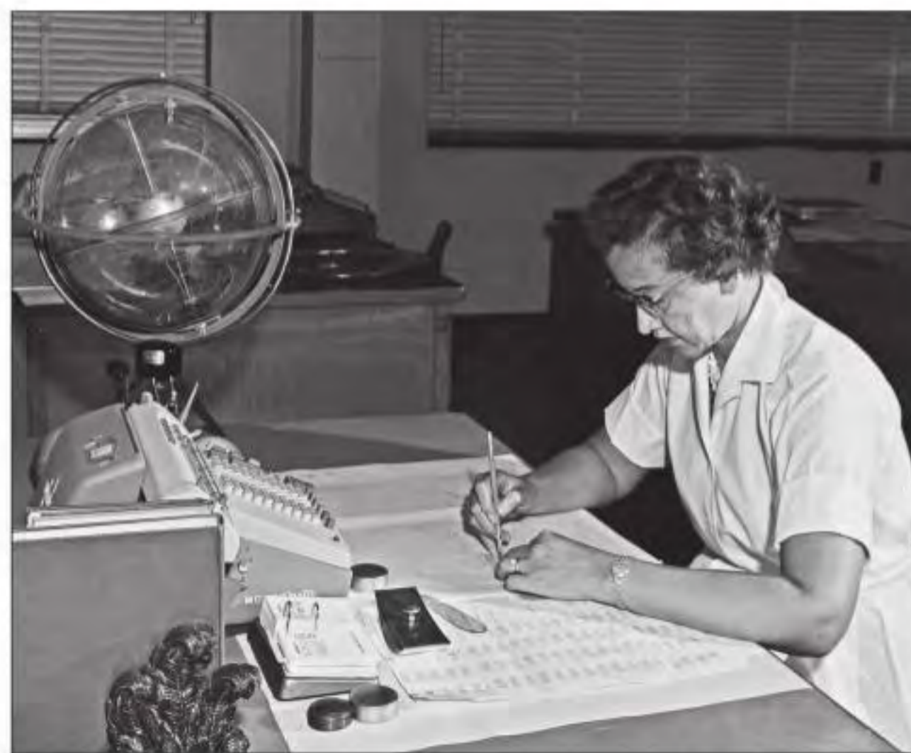
Katherine Johnson had graduated from high school at 14 and college at 18, expert at all the maths anyone knew how to teach her.

As NASA's focus turned from supersonic flight to flights in space, she was therefore deeply involved, though still behind the