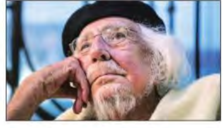
In the 1980s, he served as a minister in the revolutionary government of Nicaragua

supported the revolution resign their government positions. The Sandinista government refused the demand to replace them.