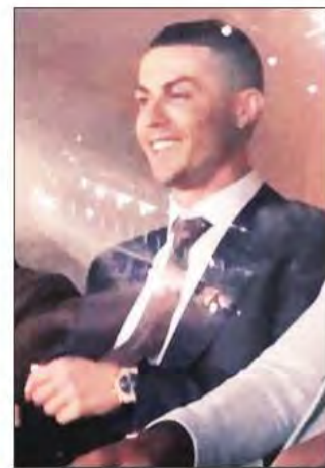
Cristiano Ronaldo was seen applauding as Vinicius Jr copied the forward's celebration after scoring the opening goal. With Serie A games postponed, Juventus' Ronaldo went to the Bernabeu to watch his former club.