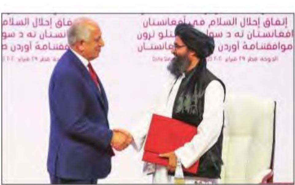
Mullah Abdul Ghani Baradar (right), leader of the Taliban delegation, and Zalmay Khalilzad, US envoy, after signing an agreement in Doha on Saturday.

A DEADLY blast shattered a period of relative calm in Afghanistan on Monday and the Taliban ordered fighters to resume operations against Afghan forces just two days after signing a deal with Washington aimed at ushering in peace.