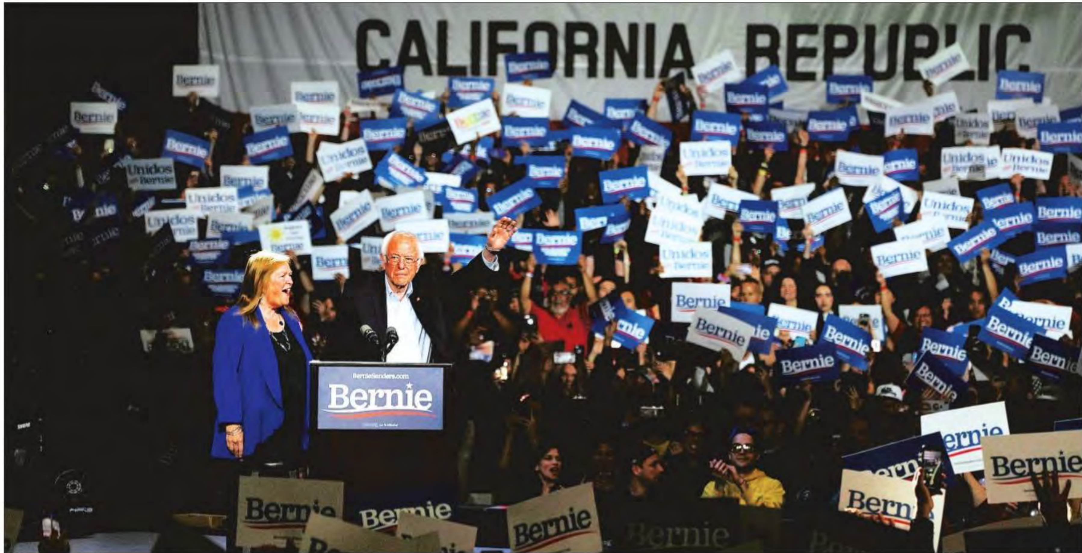
Democratic 2020 US presidential candidate Senator Bernie Sanders at a campaign rally in Los Angeles, California, on March 1.

The senator from Vermont would present America with a terrible choice