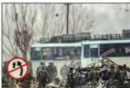
40 CRPF personnel were killed in the attack. File

According to NIA, the video eulogising Dar as a suicide bomber was shot in Shah's house and later released by JeM.