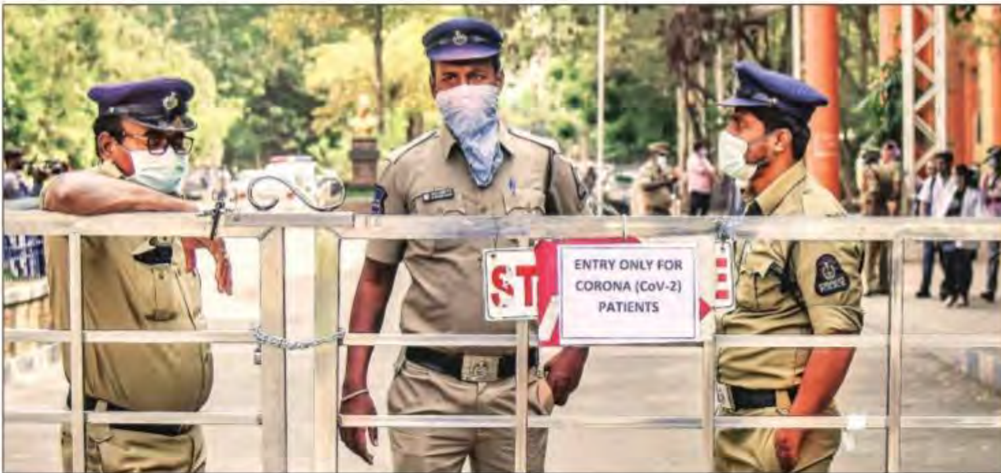
Policemen outside the Government Gandhi Hospital in Hyderabad, Tuesday.