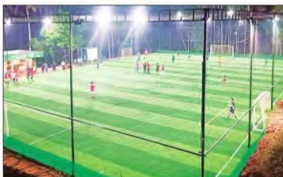
The Maracana football turf in Eletttil, Kozhikode. Kerala has about 500 artificial turfs, 150 in Kozhikode district alone.

ISRAEL ELECTION: NETANYAHU LEADS, MAJORITY ELUDES PAGE 15