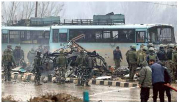
When terror struck: A file photo of security personnel inspecting the blast site in Pulwama district.