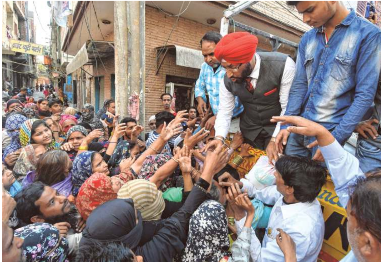
Helping hand: Riot-affected people receiving relief kits at Mustafabad in north-east Delhi on Tuesday.