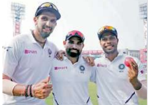
(from left) Ishant Sharma, Md Shami and Umesh Yadav.

Kohli wants the next crop to replicate the kind of success that the trio of Yadav, Ishant and Shami (Bumrah excluded) has got over years. "We recognise and understand guys who can do a similar job potentially as well as these, Umesh included."