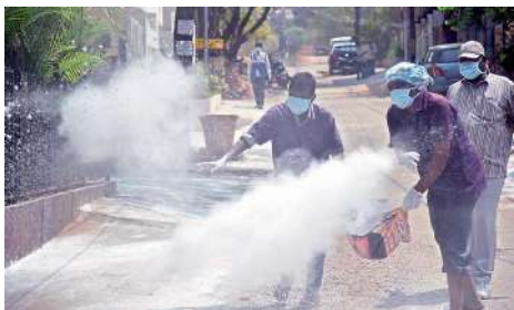
SCB personnel fumigate surroundings of the residence of the Covid-19 affected person in Mahendra Hills in the city on Tuesday.

Residents are being spread on basic safety practices and we are also planning to hold a colony residents' meeting for further safety measures in coordination with the