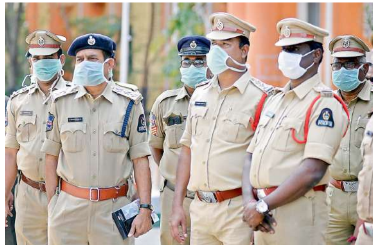
As a precaution against coronavirus, policemen wear masks at the Gandhi Hospital on Tuesday.

New Delhi, March 3: Four Indigo crew members, who were on a Dubai-Bangalore flight on February 20 with a coronavirus-infected Hyderabad resident, have been under observation since March 2, the airline said on Tuesday. On Monday, a 24-year-old software engineer from Hyderabad, who works in Bangalore, was found to be the first confirmed case of novel coronavirus from Telangana. The techie had worked with people from Hong Kong in Dubai last month, where he is suspected to have contracted the disease. He had returned to Bangalore on the Indigo flight of February 20, before travelling to Hyderabad in a bus. "The affected passengers in Hyderabad travelled on the concluding ceremony of the two-day inter-collegiate festival on Tuesday. The festival organisers turned the event into a unique workshop for sensitising the large crowd of college students about the precautionary measures that can be taken to check the spread of coronavirus." "We are following all the prescribed Airport Health Organization (APIO) guidelines and are taking preventive measures for our crew operating flights to regions affected by coronavirus, the low-cost carrier added. —PTI