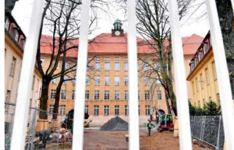
The Emanuel-Lasker-Oberschule secondary school in Berlin's Friedrichshain district, that had to be closed as one of the school's teachers is infected with Covid-19.

THE SVISS army said that all soldiers would be confined to the country's military installations after a virus case was found in their ranks.