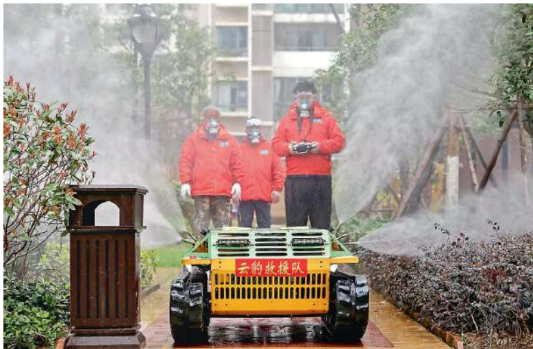
Volunteers spray disinfectant with a robot at a residential area in Wuhan of China's central Hubei province on Tuesday.