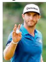
Dustin Johnson in his polo shirt.