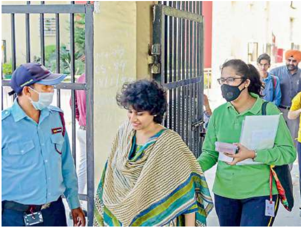
Teachers and students of Shriram Millennium school leave the campus as the school closed for two days after a student parent-tested positive with novel coronavirus, in Noida on Tuesday.

National Investigation Agency (NIA) on Tuesday formally arrested a father-daughter duo from Jammu and Kashmir's Pulwama district for their alleged role in the February 14, 2019 terror attack, in which more than 40 Central Reserve Police Force (CRPF) personnel were killed.