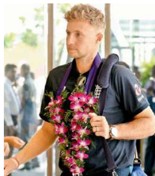
England cricket team captain Joe Root arrives with team for their tour of Sri Lanka at a hotel in Colombo on Tuesday.

London, March 3: England captain Joe Root said his players will not be shaking hands on their tour of Sri Lanka in a bid to avoid the coronavirus. Root was quizzed on the coronavirus on Monday as England prepared to depart for their two Test tour. The Yorkshire batsman said instead of shaking hands, England players will greet each other with fist bumps. England were hit by a series of gastroenteritis and flu problems before and during the first Test on their recent tour of South Africa.