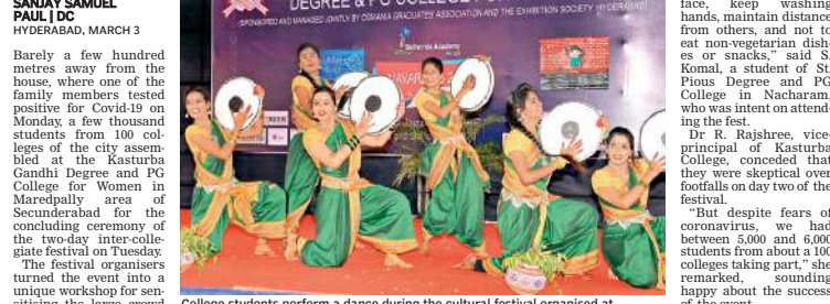
College students perform a dance during the cultural festival organised at Kasturba Gandhi Degree and PG College for Women at West Marredpally on Tuesday.