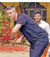
Kevin Pietersen during a promotional event in Guwahati on Tuesday.

Playing his second match post surgery, Pandya also claimed five wickets in a splendid all-round show as Reliance 1 bowled out CAG for 151 to claim a 101 run win in their final league match at the Reliance Corporate Park in Ghansoli. The sensational performance of the all-rounder from Ghansoli was watched by chairman of selectors MSK Prasad. Pandya has been on the road to recovery after going under the knife following a lower-back injury five months ago. The 26-year-old, who missed out on playing in the 2019 World Cup, had started bowling at the National Cricket Academy (NCA) in Bengaluru after returning from a long rehab in UK.