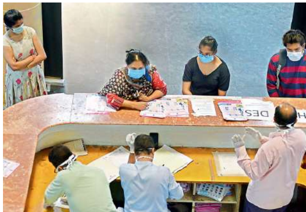
Covid-19 suspects self-admit at Gandhi Hospital in the city on Tuesday.

Doctors and staff in hospitals have to wear masks when they are in the wards and those suffering from flu, cough and cold must maintain a distance of two metres from others. The pulmonology and emergency departments, where patients arrive first, require medical staff to be in protective gear of gown, gloves, N-95 respiratory masks and eye protection.