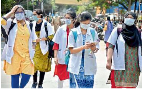
Doctors arrive at Gandhi Hospital on Tuesday wearing masks.

The minister said according to studies, 81 per cent of all Covid-19 cases are mild and resemble a common cold. Fourteen per cent of all those admitted for treatment of the disease have been cured and just three per cent from had resulted in fatalities, he added.