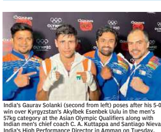
India's Gaurav Solanki (second from left) poses after his 5-0 win over Kyrzggan Solanki in the men's 57kg category at the Asian Olympic Qualifiers...

Paris, March 3: The head of a French cycling team quarantined in Abu Dhabi since last week's aborted UAE Tour said on Tuesday riders felt like victims of a "hostage-taking".