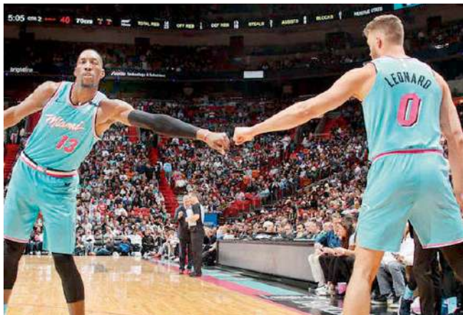
Bam Adebayo (left) of the Miami Heat goes for a fist bump with his teammate Meyers Leonard during an NBA game in this file photo.

Tokyo, March 3: A Tokyo Olympic test event featuring Paralympic wheelchair rugby has been called off because of the virus outbreak, which is threatening the Games that are expected to open in less than five months. The test event was to take place on March 12-15 in Tokyo and original plans called for athletes from abroad. Tokyo organisers on Tuesday said the Japan Para Sports Association cancelled the event in line with the Japanese government policy that is discouraging large-crowd event over the next several weeks, a move aimed at stemming the spread of the virus. Each passing day sees events canceled and that puts the future of the Olympics in jeopardy. Tokyo organisers said in a statement they would hold a wheelchair rugby test event in some form in April. The Olympics have been cancelled three times — in 1916 (Berlin), 1940 (Tokyo) and 1944 (London) — all during wartime. Tokyo organisers have 17 test events remaining on their schedule. The last one is to end of May 8. —AP