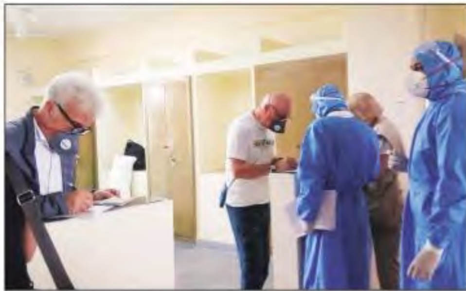
Some of the Italian tourists at the ITBP quarantine facility in Chhawla, Delhi, on Wednesday.

IRDAI ASKS INSURERS TO DESIGN COVID-19 POLICIES FULL COVERAGE, PAGES 6, 9, 13, 16, 19