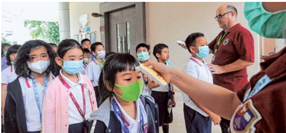
Education at risk: Officials checking the temperature of students before letting them enter a school in Tangerang, Indonesia, on Thursday.

Switzerland reported its first death from the outbreak on Thursday, while Bosnia and South Africa confirmed their first cases and Greece's cases surged after 21 travellers recently returned from a bus trip to Israel and Egypt