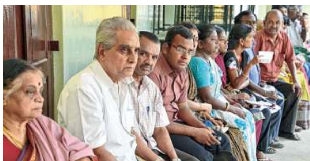
Mandated by law: People waiting to enrol their biometric details for the National Population Register, 2013.

The Ministry said there was a need to update the NPR to "incorporate the changes due to birth, death and migration". "Aadhaar is individual data, whereas NPR contains family-wise data," it said.