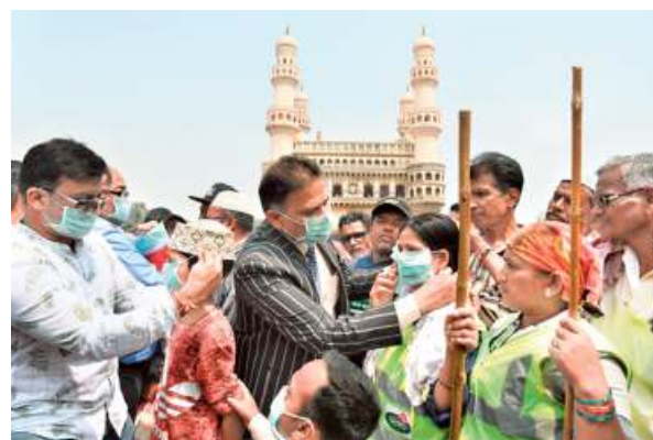
Preventive measure: NGO members distributing protective masks in Hyderabad on Thursday.