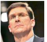
Mark Esper pictures of military installations and activities. The idea is that the more rival

The deal, which has 32 other signatories, permits one country's military to conduct a certain number of surveillance flights over another each year on short notice. The aircraft can survey the territory below, collecting information and