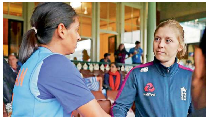
India captain Harmanpreet Kaur (left) and her English counterpart Heather Knight shake hands after play was abandoned due to rain in the ICC Women's T20 World Cup semifinal in Sydney on Thursday.

Her India counterpart Harmanpreet Kaur also agreed that the semifinals should have had a reserve day, a request which was made by host Cricket Australia but turned down by the ICC. "Unfortunately we didn't get a game, but there are reserves and we have to follow it. Having reserve days in the future will be a great idea," said Kaur. Knight said her team paid the price for not starting the tournament well. "It's all very English isn't it, talking about the