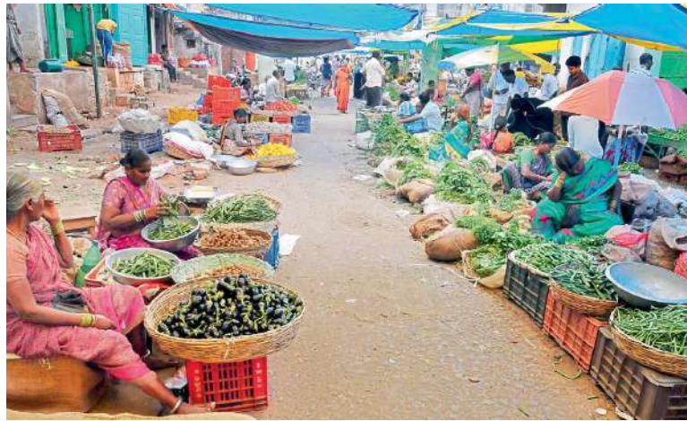
Vegetable vendors await buyers as the Monda Market wears a deserted look on Thursday amid the ongoing Covid-19 scare across the city and the state.