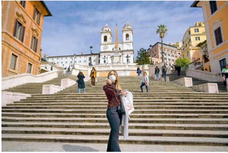
A woman wearing a mask poses for photos in front of the Spanish Steps, in Rome, a tourist attraction on Thursday which wore a deserted look following the virus outbreak in Italy.

Seattle, March 5: California Governor Gavin Newsom late on Wednesday declared a statewide emergency due to coronavirus. Washington and Florida had already declared emergencies, and Hawaii also joined them on Wednesday. Washington also announced another death, bringing its total to 10. Most of those who died were residents of Life Care Center, a nursing home in Kirkland, a suburb east of Seattle. At least 39 cases have been reported in the Seattle area, while researchers say the virus may have been circulating undetected for weeks.