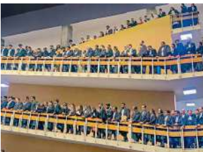
Advocates during farewell party of Justice S Muralidhar at Delhi High Court in New Delhi on Thursday.