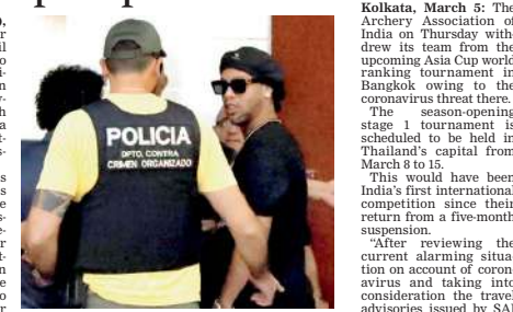
Former Brazilian football star Ronaldinho Gauchó (right) enters Paraguay's attorney offices in Asuncion, Paraguay, on Thursday.