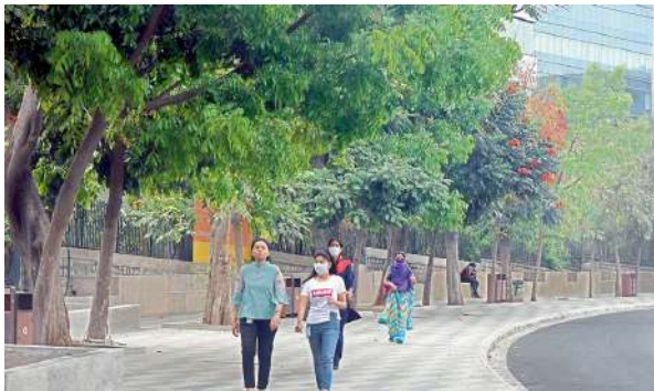
The IT corridor in Hyderabad largely sported a deserted look on Thursday as a large number of employees chose to work from home.

TJUDA says the isolation ward in the main building is putting all these patients at risk as they can be easily infected due to the highly contagious nature of the virus. They have also stated that being a multi-specialty hospital, thousands of people come every day from the districts and also nearby areas visit it or are admitted and all of them are being put at "grave risk". There is also the teaching college next to the hospital where thousands of students study and frequent wards for bedside practice. The term 'isolation' means to be far away and does not apply to Gandhi Hospital in any sense, since it is visited by thousands of people night and day. To ensure that there is 'isolation' in the true sense, the government must shift the Covid 19 facility to hospital which deal with infection diseases and are also isolated in the true sense of the term, like Chest Hospital in Huzurabad and TB hospital in Vikarabad.