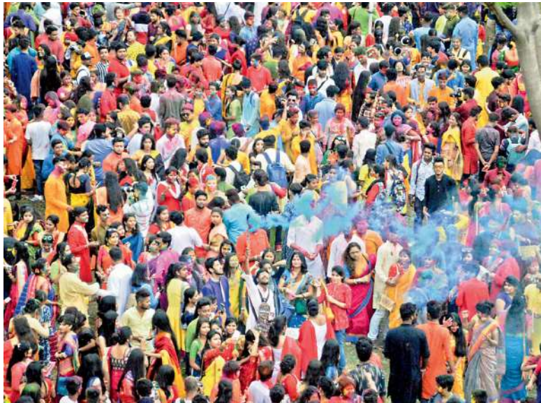
Students play with colours during Basant Utsav celebration, at Rabindra Bharati University in Kolkata on Thursday.