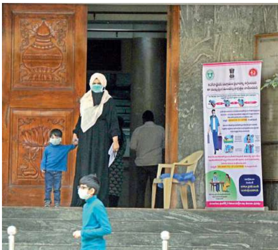
People, in the rumour of the virus infection, approach Gandhi hospital for further treatment on Thursday.