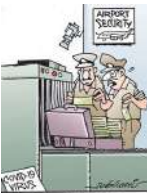
Not gold... he is smuggling masks!