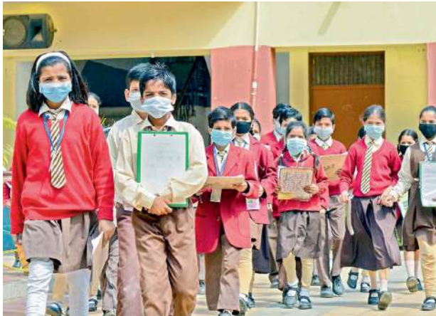
School students wear mask to mitigate the spread of coronavirus as they arrive to appear for an examination in Agra on Thursday.