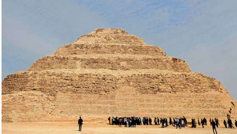
Tourists visit the step pyramid of Djoser in Egypt's Saqqara necropolis, south of Cairo on Thursday. Egyptian authorities inaugurated the famed step pyramid of Djoser, one of the earliest built in the country's ancient history, after years of renovation. The 4,700-year-old structure is nestled in the ancient capital of Memphis, a UNESCO World Heritage site, home to some of Egypt's most fascinating monuments. Renovation works started in 2006 but was interrupted in 2011 and 2012 for 'security reasons' due to turmoil caused by a popular uprising that toppled late president Hosni Mubarak.