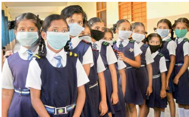
Schoolchildren wear masks at a school in Hyderabad on Thursday.

The government was making every effort to stop Covid-19 in the State. "This is a global and national emergency," the health minister said. He also urged people to practice good hygiene, whether when coughing or sneezing, and particularly with reference to hand hygiene, the state health minister urged people not to panic or spread fear about the disease.