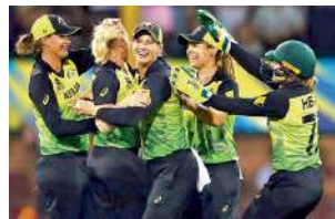
Australia celebrate their win over South Africa in the semifinal on Thursday.

There were fears that the second semifinal between Australia and South Africa at the SCG too will be washed out because of the rain. The India and England match earlier in the day. But the weather improved just enough to get a game albeit a curtailed one. Australia skipper Meg Lanning led from the front with unbeaten 49 off as many balls to take her team to 134 for five in 20 overs. South Africa returned during the innings break and South Africa were set a revised target of 98 runs in 15 overs as per the D/L method. South Africa ended at 92 for five despite a fighting 41 not out off 27 balls from