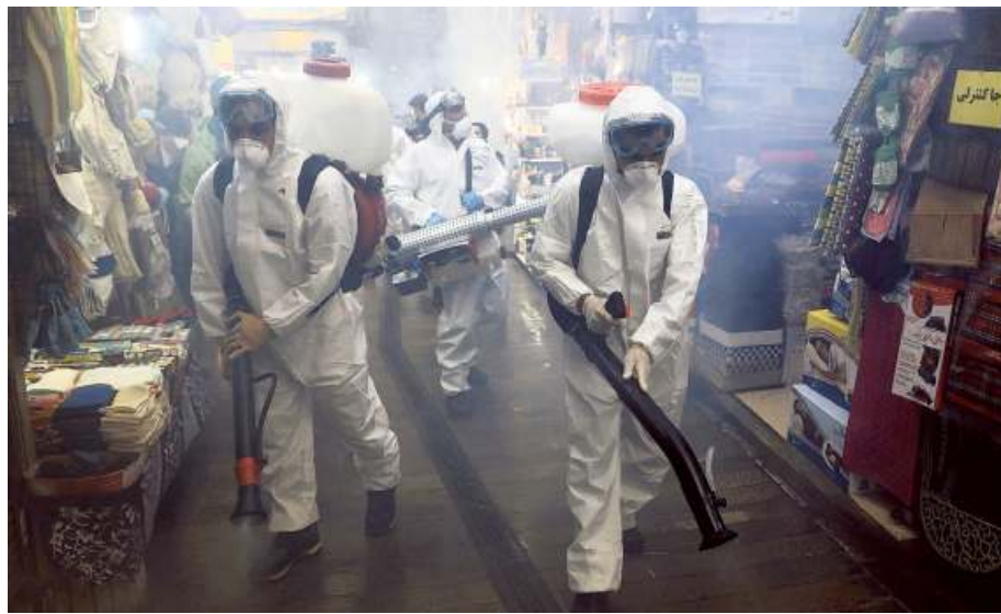
Germproof: Firefighters disinfecting a shopping centre to prevent the spread of the new coronavirus, SARS-CoV-2, in northern Tehran on Friday.

The new cases "are probably those who had been infected with the virus two