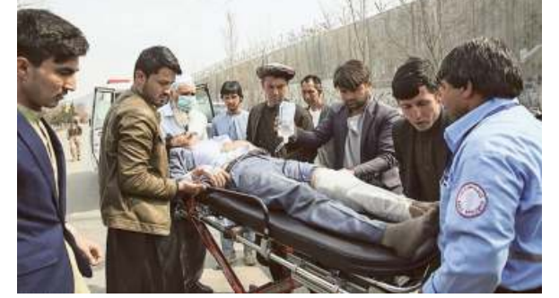
An injured man being carried in a stretcher after the attack in Kabul on Friday.