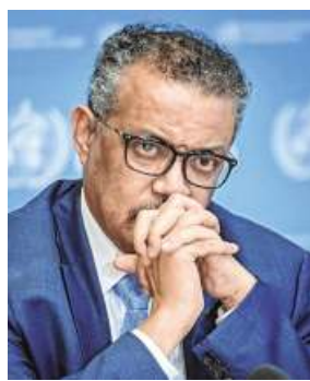
Tedros Adhanom Ghebreyesus, D-G, WHO

"We are now on the verge of reaching 1,00,000 confirmed cases," WHO director general Tedros Adhanom