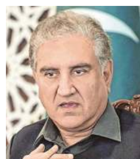
Shah Mahmood Qureshi

Addressing the Senate on Wednesday, Mr. Qureshi said that Pakistan neither desires any security role for India in Afghanistan nor wants the presence of militant organisations – al-Qaeda and the ISIS – in the landlocked country, The Nation reported.