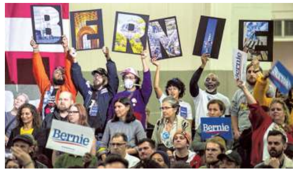
The last phase: Supporters of candidate Bernie Sanders during a campaign rally in Detroit, Michigan, on Friday.

"Joe Biden and I have a very serious disagreement with regards to NAFTA," Mr. Sanders said at a round table he