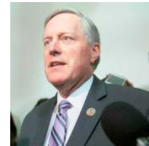
Mark Meadows, who was chosen on Friday as the new Chief of Staff.

Mr. Meadows takes over as the White House struggles to advance a consistent message about the COVID-19 crisis and as Mr. Trump goes into a bruising re-election contest. He becomes the fourth Chief of Staff in Mr. Trump's three years in office, tasked with attempting to bring order to a chaotic