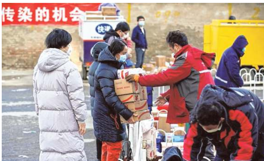
Stocking up: A Chinese woman picking up a shipment outside her apartment block on Saturday in Beijing.

corded in France rose to 716 with 11 deaths. Italy, meanwhile, began recruiting retired doctors on Saturday as part of urgent efforts to bolster the healthcare system with 20,000 additional staff.