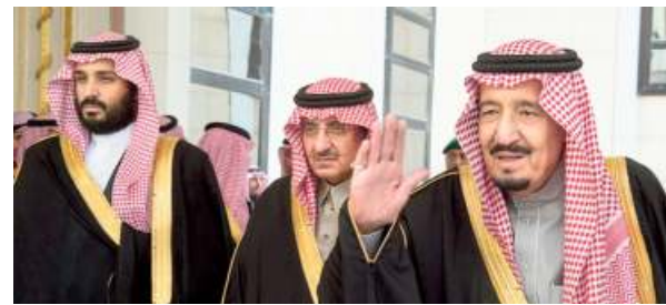
In happier times: Saudi King Salman, right, Mohammed bin Nayef, centre, and Crown Prince Mohammed bin Salman, left, in Riyadh in a 2016 photo.

Five sources told Reuters that Prince Ahmed and Mohammed bin Nayef were detained in the latest operation. Three of the sources,