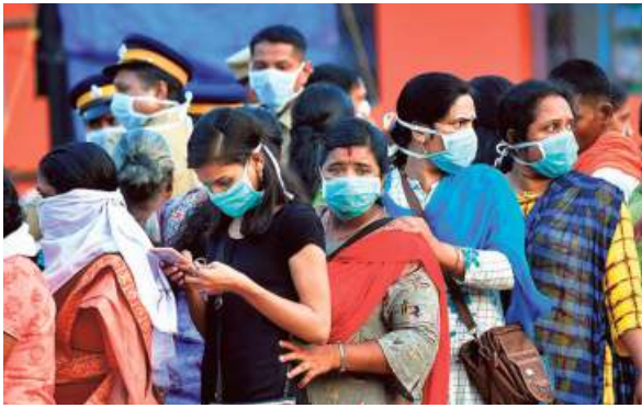
Masking their worries: Devotees wearing masks at the Attukal temple in Thiruvananthapuram on Sunday.

All three, who were reportedly having mild fever, failed to inform the airport authorities or the Health Department officials that they