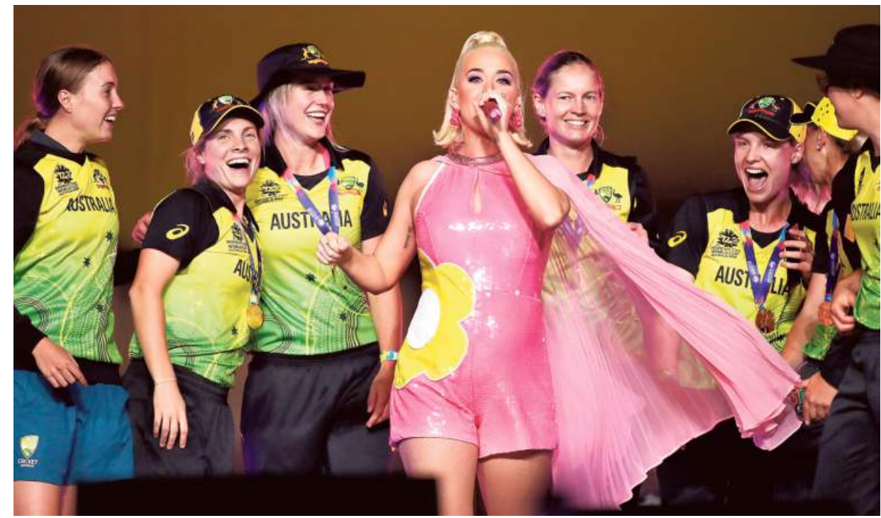
Setting the stage on fire: Katy Perry performing with the Australian cricket team following their victory over India in the ICC Women's T20 Cricket World Cup final at the Melbourne Cricket Ground on Sunday. (REPORT ON PAGE 20)