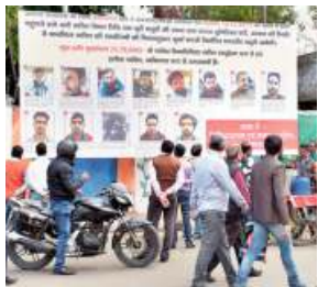
Lucknow hoardings show those who have to pay compensation.

The court moved the hearing, scheduled for 10 a.m., to 3 p.m. on the request of the government that the AG required more time