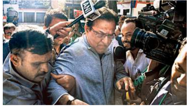
More trouble: ED officials taking Rana Kapoor to a hospital in Mumbai for a check-up on Sunday.