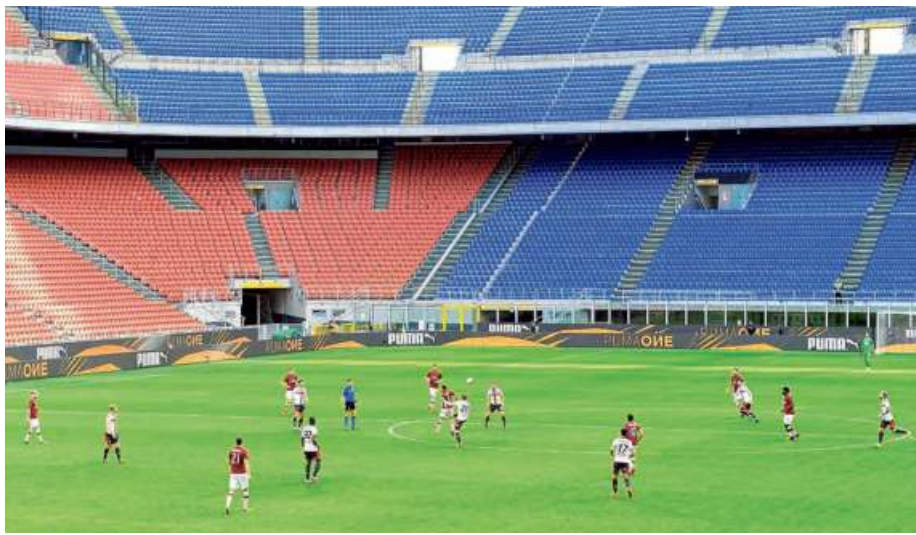
Nobody to cheer: A view of the empty San Siro stadium in Milan on Sunday during the Serie A soccer match between AC Milan and Genoa.

After Italy saw its biggest one-day jump in infections on Saturday, Italian Premier Giuseppe Conte signed a quarantine decree overnight for the country's prosperous north. On Sunday, death toll rose by 133 to 366, the se-