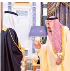
A handout picture showing Saudi Arabia's King Salman meeting a diplomat.

The detentions also raised speculation about the health of the 84-year-old King and