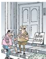
Don't panic... bank is closed due to Holi!