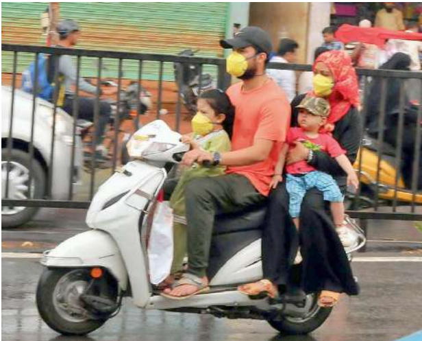
A family wears masks while on a drive in the city on Sunday. While many people have preferred staying indoors, some are wearing masks and venturing out after a techie tested positive for coronavirus.