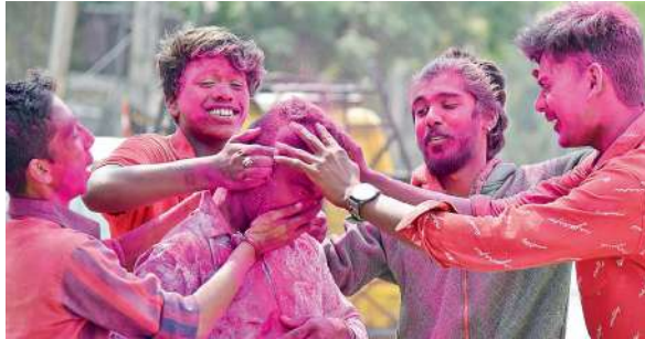
Youngsters celebrate the festival of colours ahead of Holi which is on March 10 in the city on Sunday.