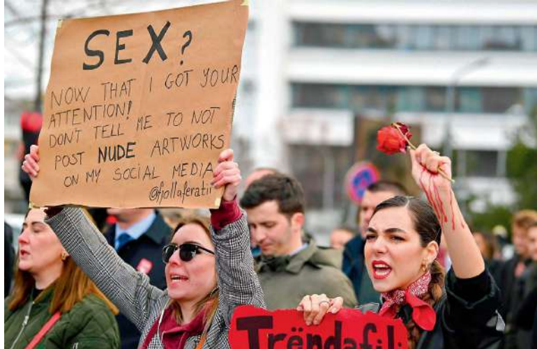
Women hold signs and shout slogans during a rally for gender equality and over violence against women to mark the International Women's Day in Pristina, Kosovo on Sunday.