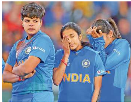
Shafali Verma (from left), Jemimah Rodrigues and Radha Yadav are dejected after India's 85-run defeat to Australia in the Twenty20 World Cup final at the Melbourne Cricket Ground on Sunday.

ner Poonam Yadav with percentage game while taking the likes of medium-paceer Shikha Pandey and Deepthi Sharma to the cleaners. On the day, Pandey was smashed for 32 runs in her four overs. Half the battle was won there for the formidable Australians, who, in stark contrast to the India, saved their best for the last. The manner and magnitude of the defeat, including a few sub-plots, were reminiscent of the 2003 men's World Cup final when Ricky Ponting's Australia thrashed Sourav Ganguly's India in an anti-climactic title clash. Like Zaheer Khan in his opening over at the Wanderers against Adam Gilchrist and Matthew Hayden, Deepthi Sharma was all nerves when up against Mooney and Healy, who blasted massive sixes as the beaming husband Mitchell Starc watched from the stands. "The match was as good as over when India were 18/3 in the fourth over, which became four for 4/30 when skipper