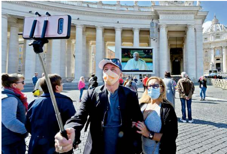
A couple takes selfie pictures in front of a screen live-broadcasting Pope Francis' Sunday Angelus prayer at the Vatican on Sunday.