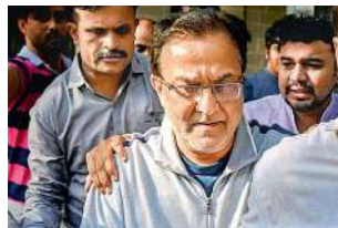
Yes Bank former promoter Rana Kapoor being taken to a court after being arrested by the Enforcement Directorate under money laundering charges in Mumbai on Sunday.

NEW DELHI/MUMBAI, MARCH 8 A court on Sunday remanded Yes Bank founder Rana Kapoor to the Enforcement Directorate's (ED) custody till March 11 after he was arrested on charges in the early hours of Sunday. "The ED, which had summoned Kapoor to its office on Saturday afternoon after raids at his and his daughters' residences in Mumbai and Delhi, arrested him following several hours of interrogation. The Central Bureau of Investigation (CBI) has, meanwhile, begun a probe into Yes Bank's affairs as officials started collecting documents on the matter, sources said Sunday. They said the officials have refused to comment on the developments. CBI wants complete secrecy before any search that it might be planning. The sources refused to elaborate on the nature of the probe — preliminary