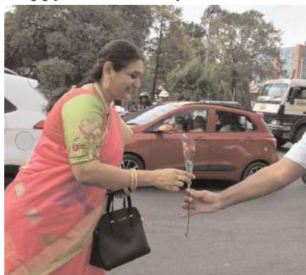
A traffic policeman greets a woman with flowers and a gift coupon during a special drive to mark International Women's Day at Sangatee crossroads, Secunderabad, on Sunday.