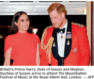
Britain's Prince Harry, Duke of Sussex and Meghan, Duchess of Sussex arrive to attend The Mountbatten Festival of Music at the Royal Albert Hall, London.

were cheers when Meghan appeared and called for "the women of our future" to "believe in themselves" and "really stand in your truth, to stand for what is right to continue to respect each other". The couple will next join Queen Elizabeth II and the rest of the royal family for the annual Commonwealth Service at Westminster Abbey on Monday to mark women's empowerment. It would be the first time the entire royal family is seen together in public since Harry and Meghan announced they were stepping down from royal duties.