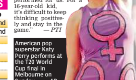
American pop superstar Katy Perry performs at the 2020 T20 World Cup final in Melbourne on Sunday.