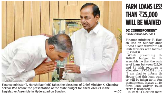
Finance minister T. Harish Rao (left) takes the blessings of Chief Minister K. Chandrababu Naidu before the presentation of the state budget for fiscal 2020-21 in the Legislative Assembly in Hyderabad on Sunday.

The finance minister said ₹205 crore was proposed for panchayat raj and rural development. Another ₹14,809 crore is for the municipal department, besides the monthly ₹148 crore for the development of towns and cities. "Under the Urban Mission Bhagrathi 800 crore, we are proposing ₹86 crore for the remaining 58 municipalities," said the finance minister during the Assembly. ■ Page 5: 28HK project gets ₹11,000cr, schools ₹10,000cr