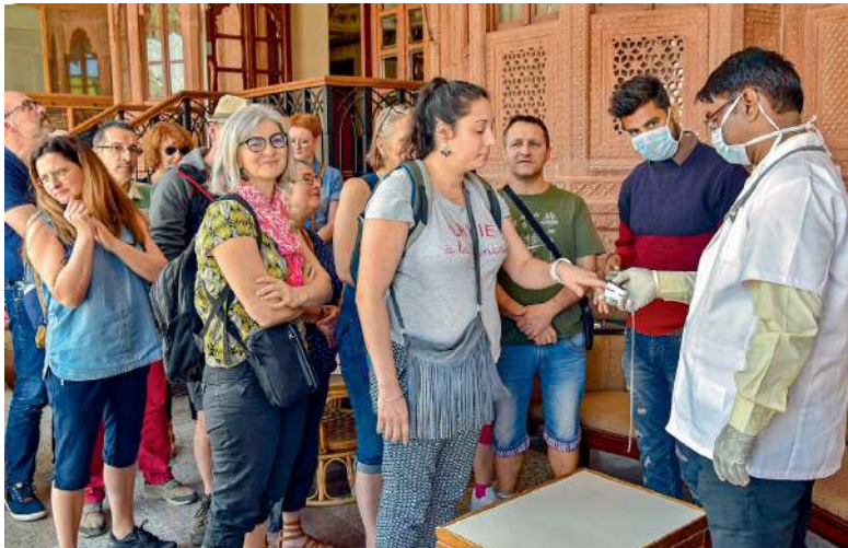
Medics screen tourists in the wake of the novel coronavirus scare, at a hotel in Bikaner on Sunday.