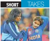
Taniya Bhatia (right) walks off the field after suffering a concussion in the T20 World Cup final on Sunday.