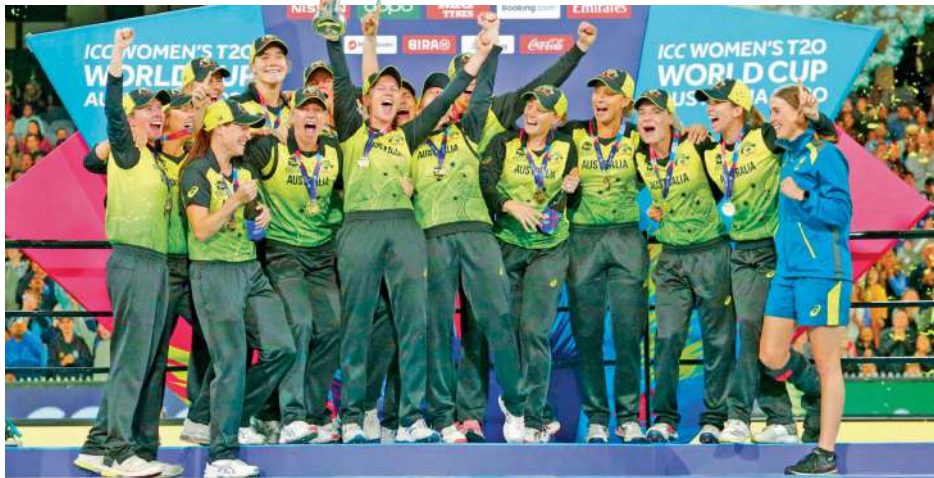
Australian women celebrate winning the ICC T20 World Cup in Melbourne on Sunday. They beat India by 85 runs in the final to take their fifth T20 title.

Melbourne: Senior India player Smriti Mandhana called for the team to be left alone after its 85-run mauling by Australia in the ICC Women's T20 World Cup final here on Sunday. "This is a time to introspect. Failure teaches you a lot more than success. The team needs to be left alone and think of how we can be better in the next few years," Mandhana said after her team's loss. Mandhana believed India are a transformed team in the shortest format, and she attributed it to head coach WV Raman. "T20 was never our best format, one day was definitely the preferred format. Now we're playing each format equally well. That is one thing the coach has helped us with and we've developed massively," she said. "The youngsters coming in have totally changed the set-up and the best part of the tournament was it was a complete team performance. That's one thing Raman has done — developing us as a team not just one or two players. Today, it didn't work out but we've grown as a team, not just as one or two players." Mandhana's disappointing T20 World Cup — that saw her manage a top score of 17 in four innings — continued as India sunk to 99 all out. — PTI