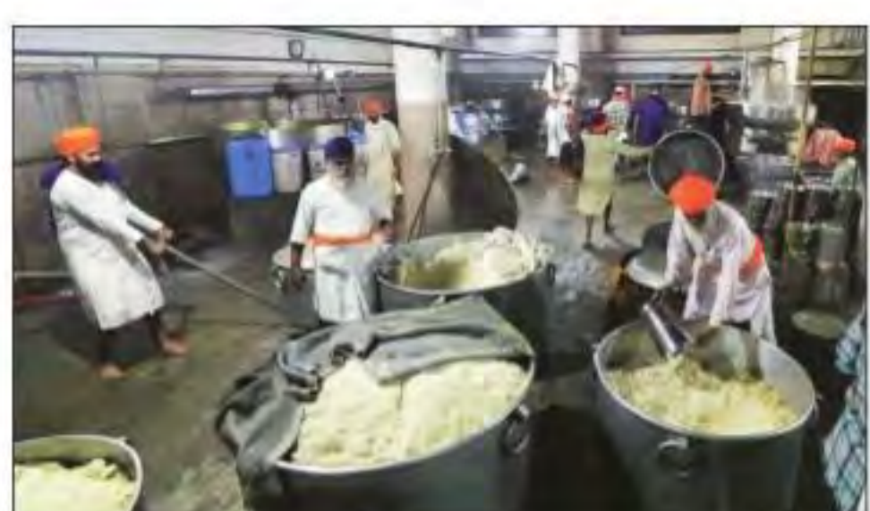
A langar at Gurdwara Langar Saheb in Nanded.

The pilgrims arrived between March 1 and March 20 and have