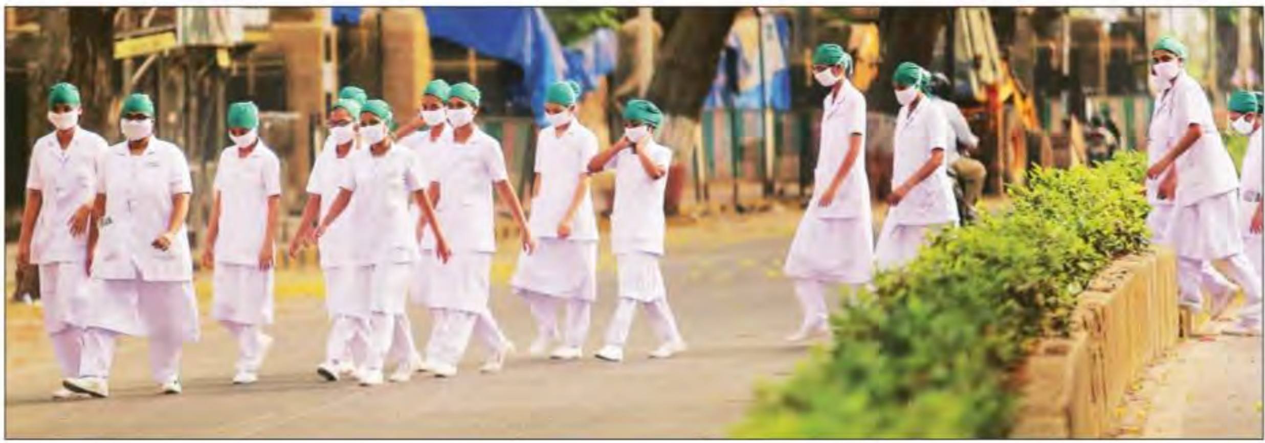
Nurses from Mumbai's KEM hospital on their way to work. The hospital has reported at least 10 COVID-19 deaths over the last week. Prashant Nadkar