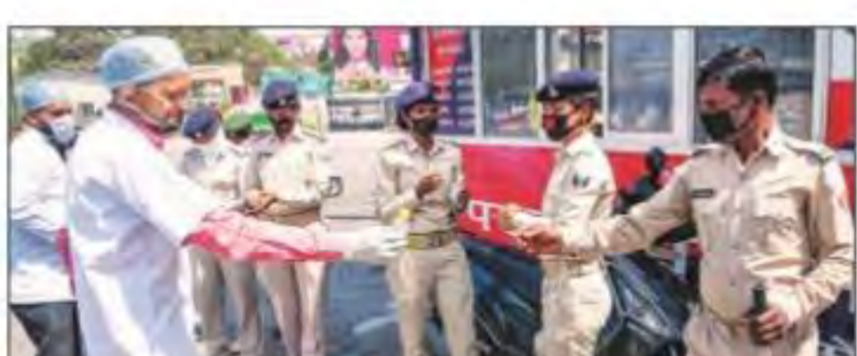
Medical staff distribute sanitisers to policemen in Patna.

According to the Bihar health department, 4,991 people have