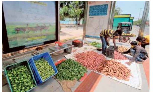
Reaching the people: Vendors selling vegetables from a bus stop in Bhubaneswar on Thursday.

Activities related to agriculture, animal husbandry and MGNREGS would be fa-