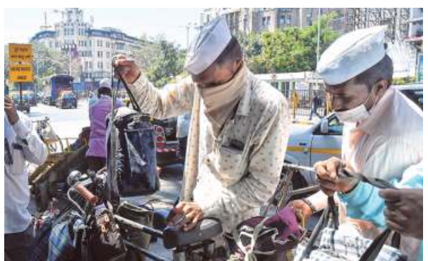
Hard times: Dabbawalas at work in south Mumbai before the lockdown was announced.

Depending on how far a tiffin box had to be delivered, a dabbawala could earn between ₹13,000 to ₹15,000 a month. "This amount, along with whatever our spouses could earn, had to suffice for all