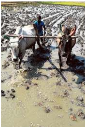
A farmer readying his field in Madurai district of Tamil Nadu.

Overall sowing of summer crops, including rice, pulses, coarse cereals and oil seeds, is about 31% higher than usual. In total, 48.8 lakh hectares have been sown so far.