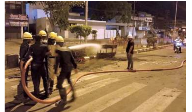
Swift action: Fire services personnel dousing fires set by migrant workers in Surat on Friday.

As the crowd of protesters grew, some elements turned violent, setting vegetable carts on fire and vandalising shops and properties along the road in the Laskana area, a migrant hub. Within an hour, about a dozen properties and as many vegetable carts were gutted. The police used force to disperse the mob, and more than 70 per-