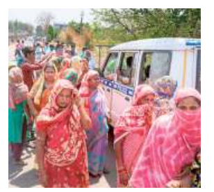
Villagers protesting against the setting up of quarantine centres at Sian in Birbhum district of West Bengal.

In an April 10 letter to the Chief Secretary and the Director General of Police, West Bengal, the MHA said it had received reports from security agencies about "gradual dilution of lockdown" with an increase in the number of exceptions being provided by the State