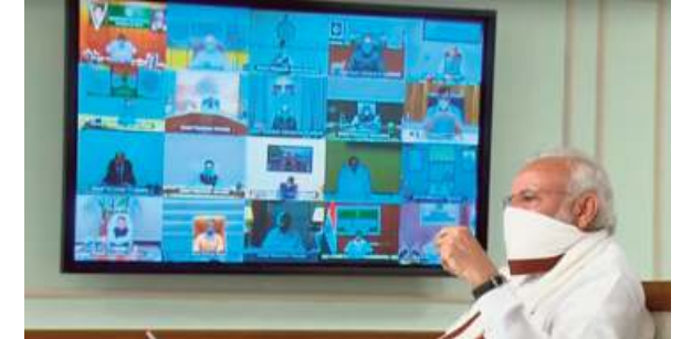
Talking strategy: PM Narendra Modi in a meeting with Chief Ministers via video conference in New Delhi on Saturday.