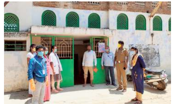
Intensive checks: Coimbatore Corporation workers checking houses in Ukkadam on Wednesday.