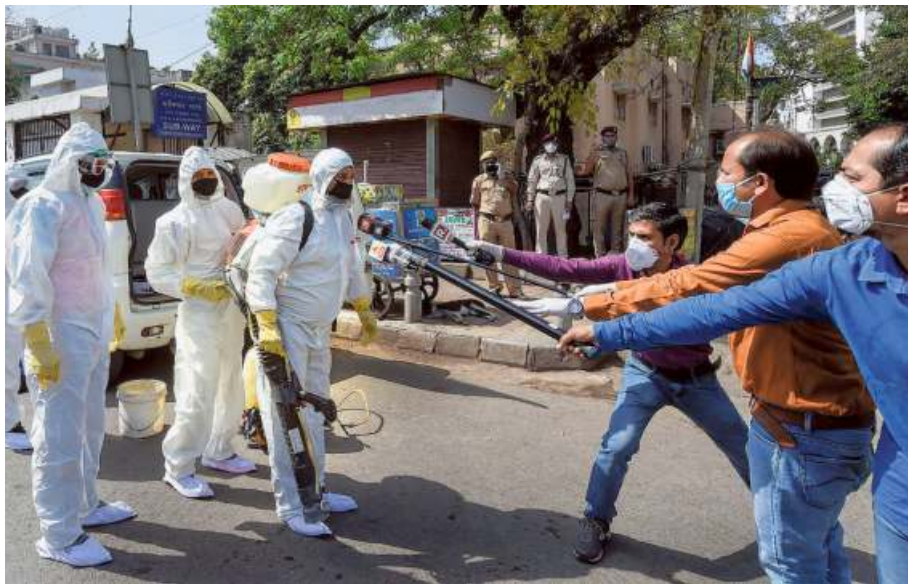
Reaching out, for safety: Media personnel maintaining physical distance as they interview health workers sanitising an area near the Nizamuddin mosque in Delhi.

"Most of them are testing positive. We have so far got only about 15 negative cases. If you put 2,000 people in a closed building, everyone is bound to have it," a Delhi government official told The Hindu . The official said they were coordinating with other States and evacuating peo-