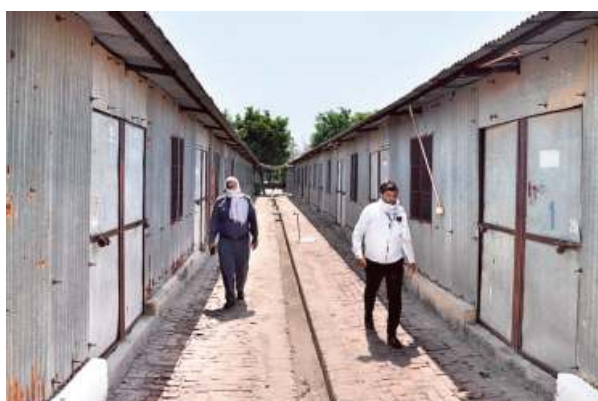
Staff checking the facilities at the Jaypee Sports Complex on the Yamuna Expressway on Wednesday.

Spread over approximately 12 acres, the facility consists of an estimated 57 large tin sheds – some of which have been designated 'family sheds' – lined with wooden panelling to keep a check on the ambient temperature as summer progresses, mats with visibly clean white sheets, sanitation and potable water supply, in addition to separate toilets for men and women.