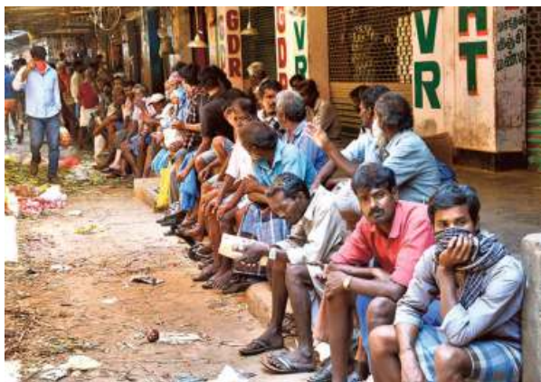
Hunger pangs: Workers waiting for meals being distributed at the Koyambedu Market in Chennai.

An official of the Indian Council of Medical Research