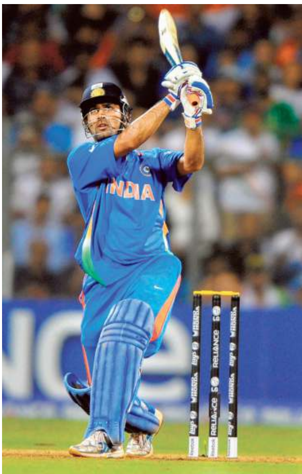
For posterity: M.S. Dhoni’s six to bring World Cup glory is one of the enduring images of Indian sport.

That was then; Dhoni at the height of his powers. Now, the scenario is different. Time waits for no one and Dhoni is pushing 39. Deep down Dhoni realises that his best days are be-