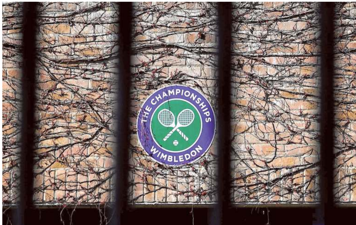
Locked out: Yet another blue riband sports event became a victim of the coronavirus pandemic, with Wimbledon – the premier grass court event in the world – deciding to host it next year.

Wimbledon has been held every year since 1946 after a six-year hiatus because the country was at war.